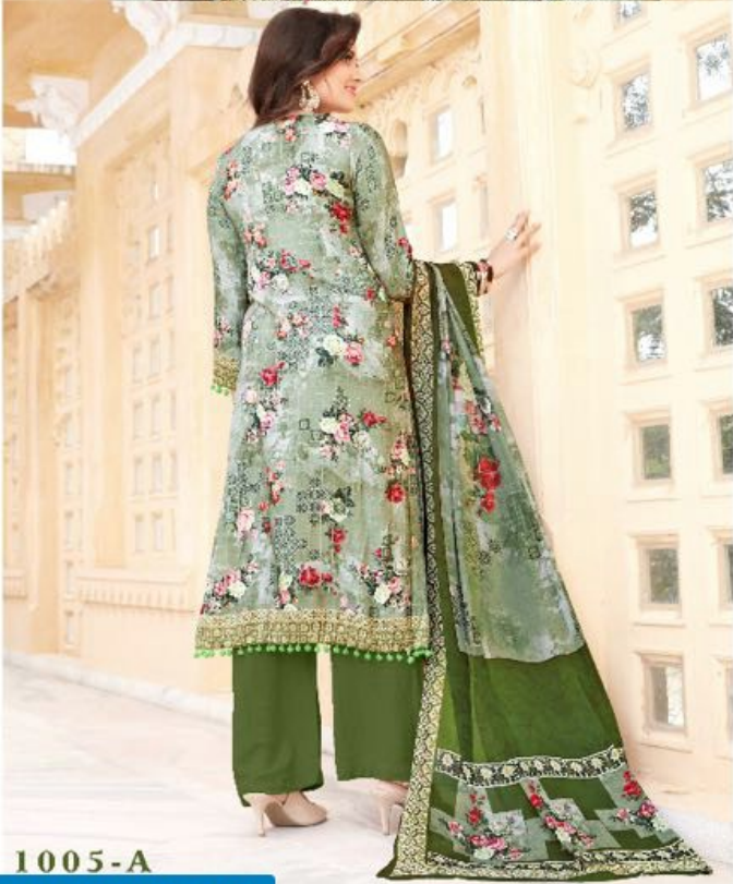
1005-A TEXTILE DEAL