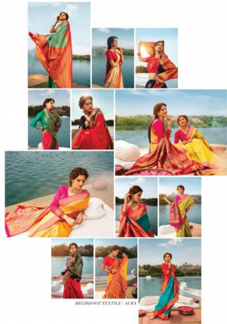
MEGHDOOT TEXTILE | AURA

Luxuriate in an endearing drape with a million dollar memories and you are definitely ought to be LIONIZED .