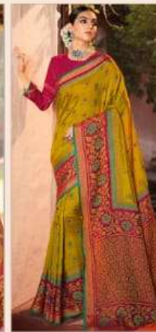
● 1914 ●