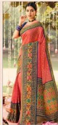
● 1908 ●