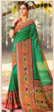
● 1901 ●