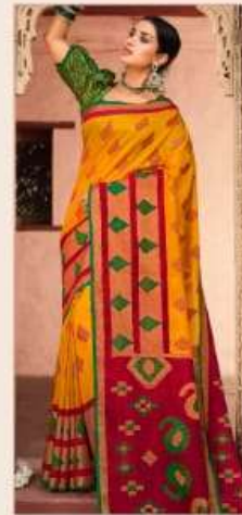
● 1909 ●