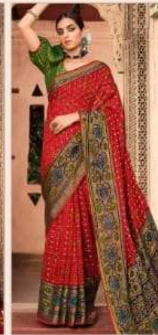
● 1910 ●