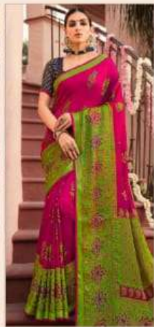
● 1907 ●