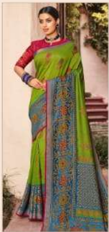
● 1906 ●