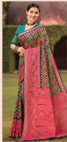
● 1903 ●