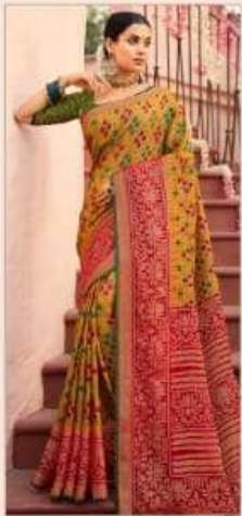
● 1902 ●