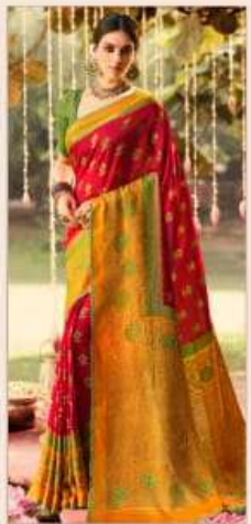
● 1905 ●