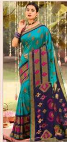
● 1904 ●