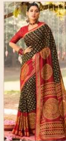
● 1913 ●