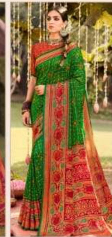
● 1912 ●