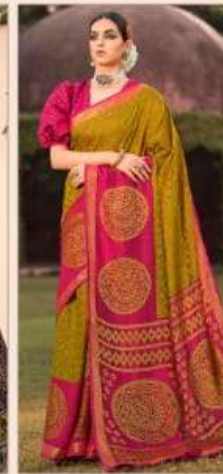
● 1911 ●