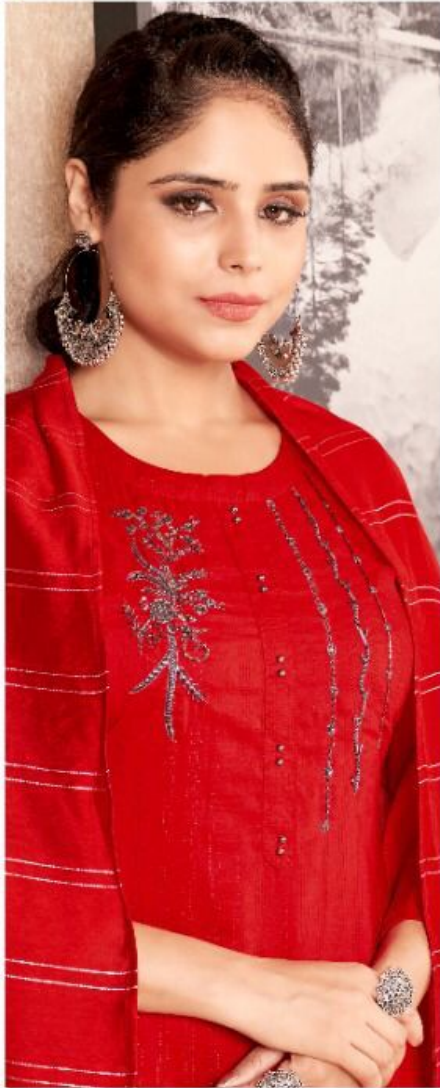
A DESIRE THAT IS ADORABLE AND PLEASANT TO MIND, A DESIRE THAT HAS MANY WAYS TO UNFOLD ITS LAYERS.