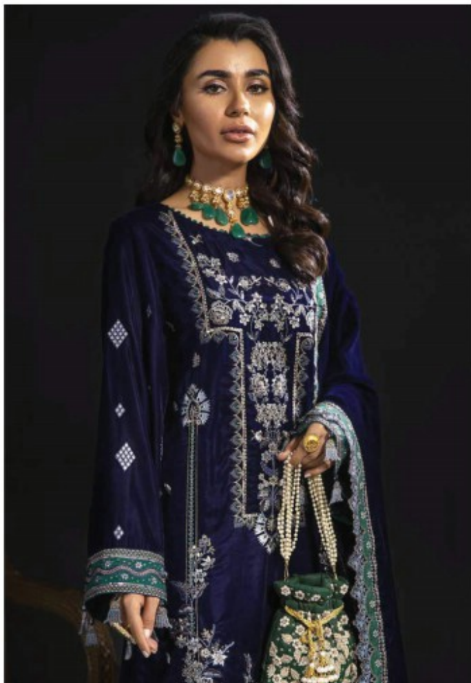
TEXTILE DEAL NV-II