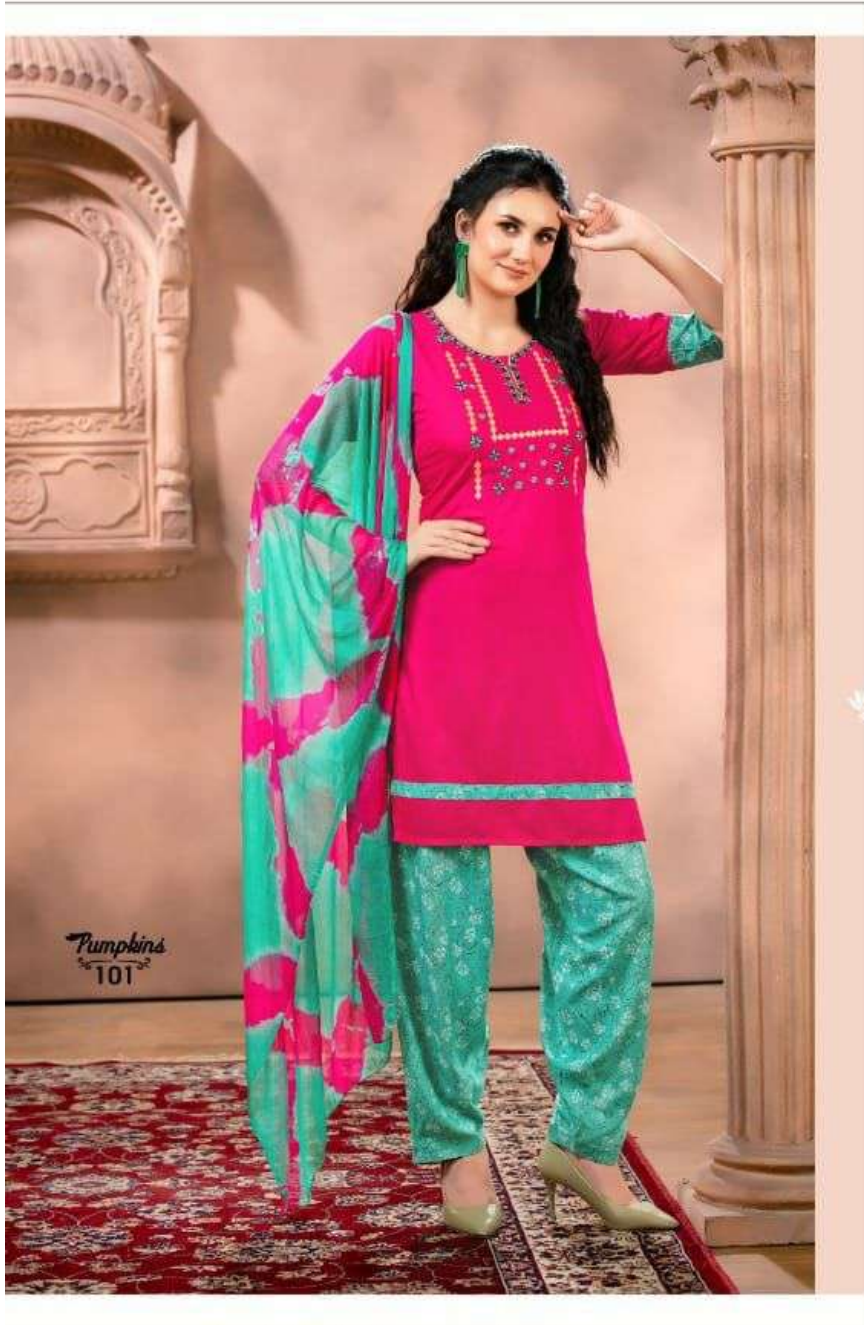
ROSE NET PANELLED AND TRILLED LEHENGA WITH ZARI WORK ON IT KAYING BEIGE NET CUTWORK DUPATTA, PAIRED WITH BEIGE MODAL SATIN EMBROIDERED ALOUSE