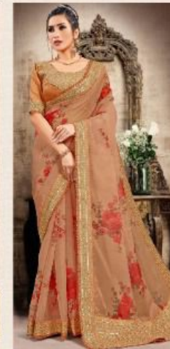
Design : 349-C