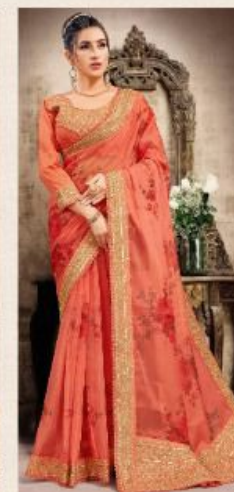
Design : 349-E