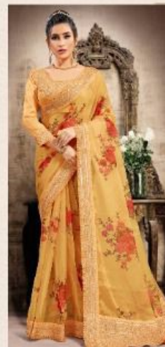
Design : 349-A