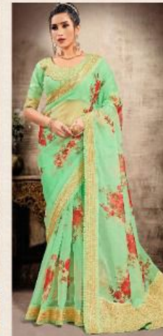
Design : 349-B