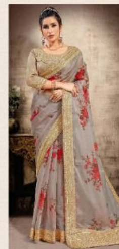
Design : 349-D