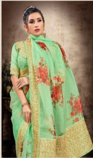
Design : 349-B