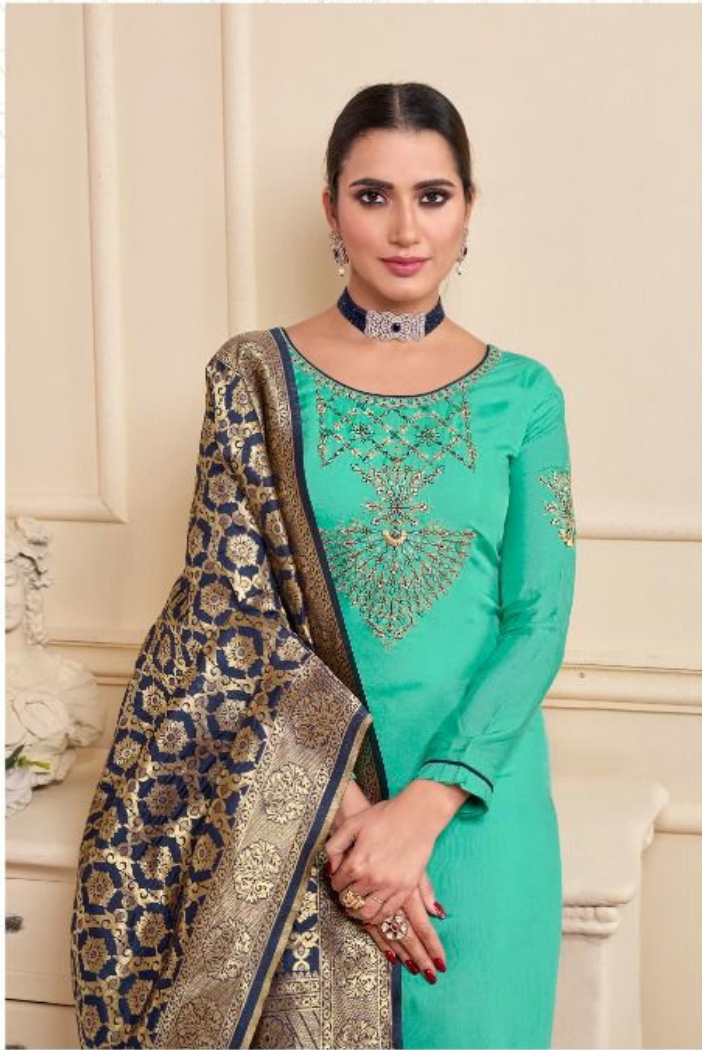
We must never confuse elegance with snobbery.