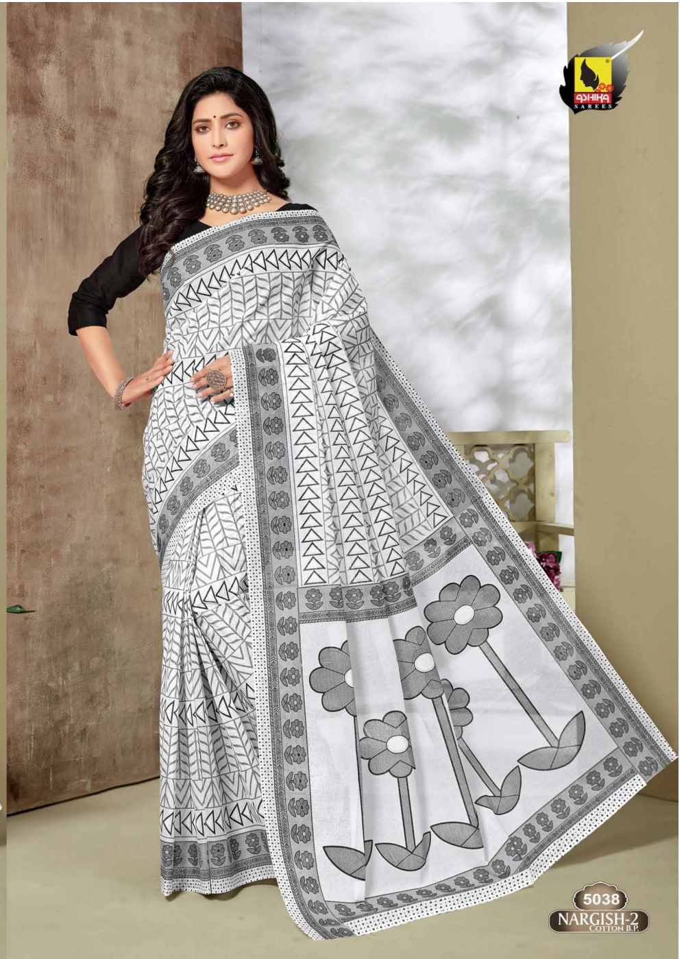
5038 NARGISH-2 COTTON B.P.