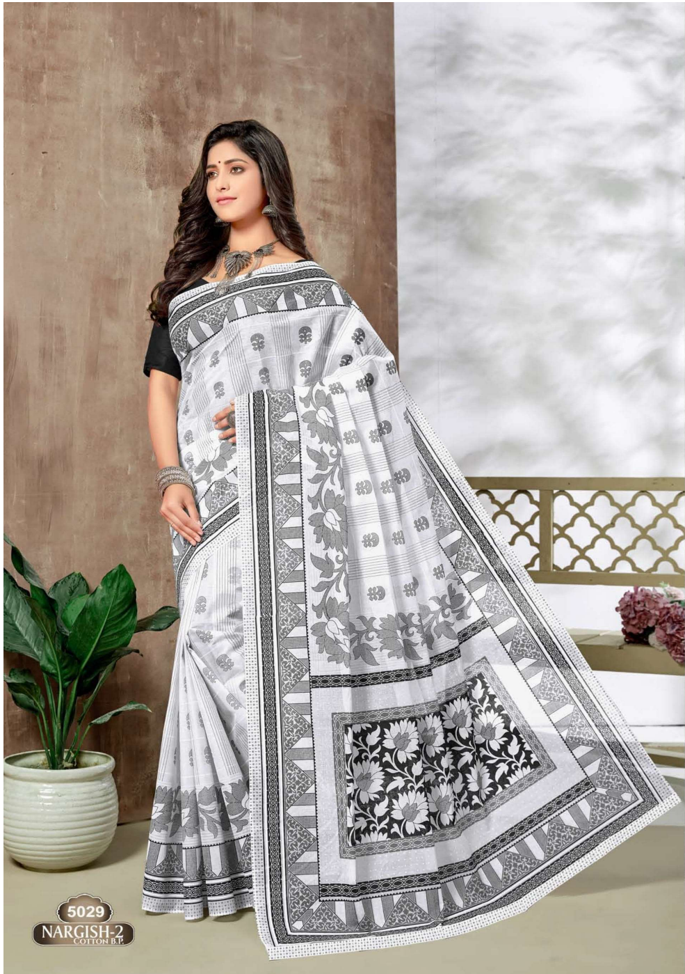
5029 NARGISH-2 COTTON BP

stylish ELEGANCE Embrace one of the purest trends this season