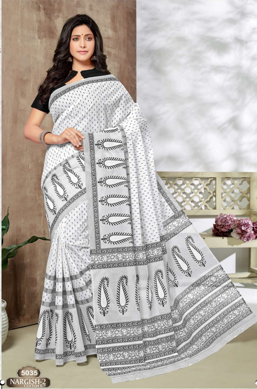
5035 NARGISH-2 COTTON B.P.