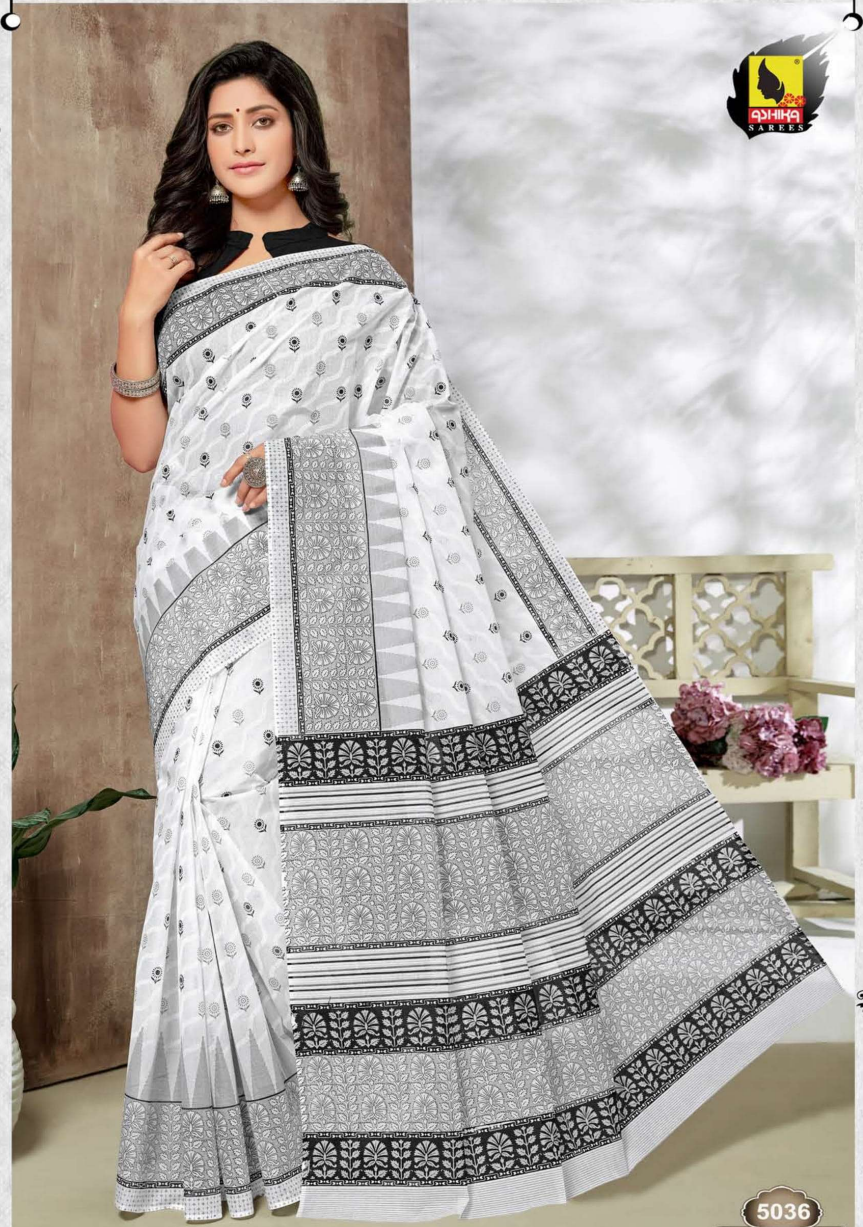
5036 NARGISH-2 COTTON B.P.