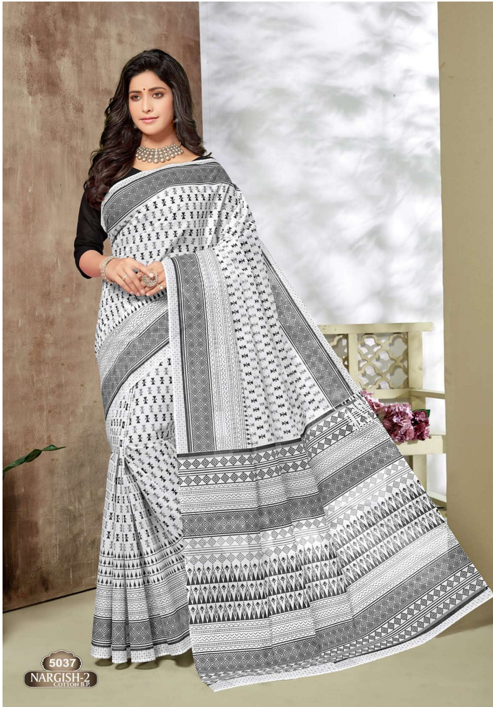
5037 NARGISH-2 COTTON B.P.