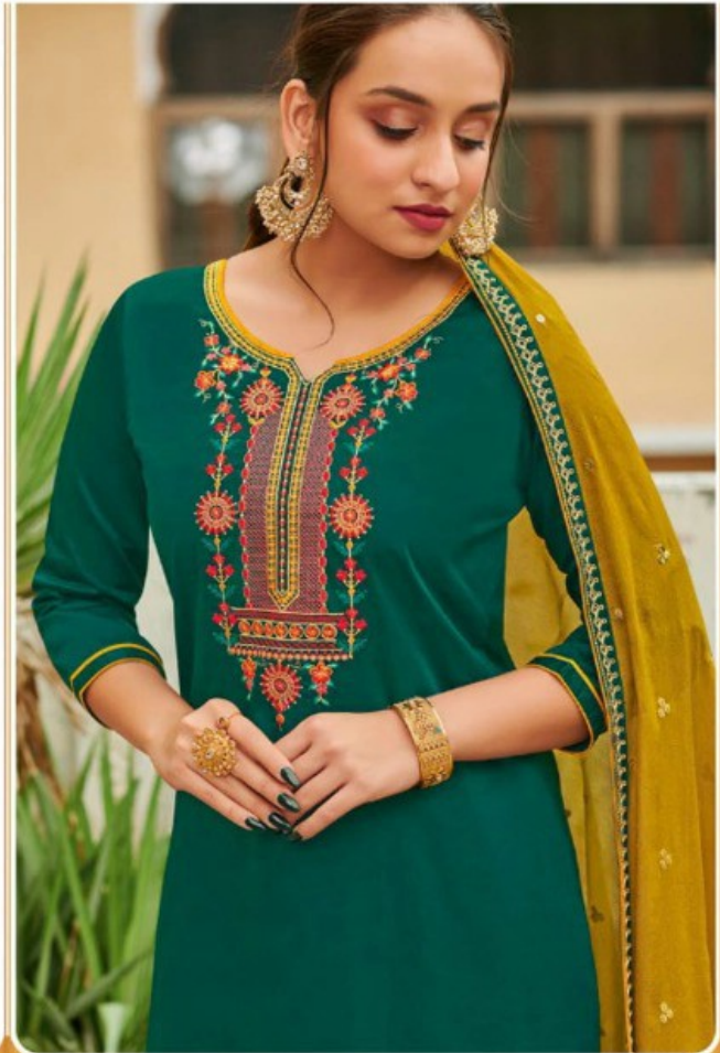
The contemporary design for the fashion conscious woman while preserving the traditional art and culture of India.