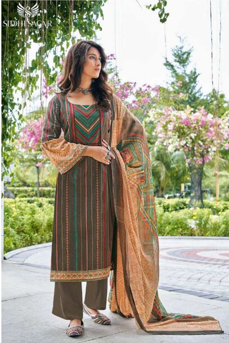
LUXE FABRICS, BOLD PATTERNS & SUMPTUOUS DETAILING ADORN MODERN SILHOUETTES