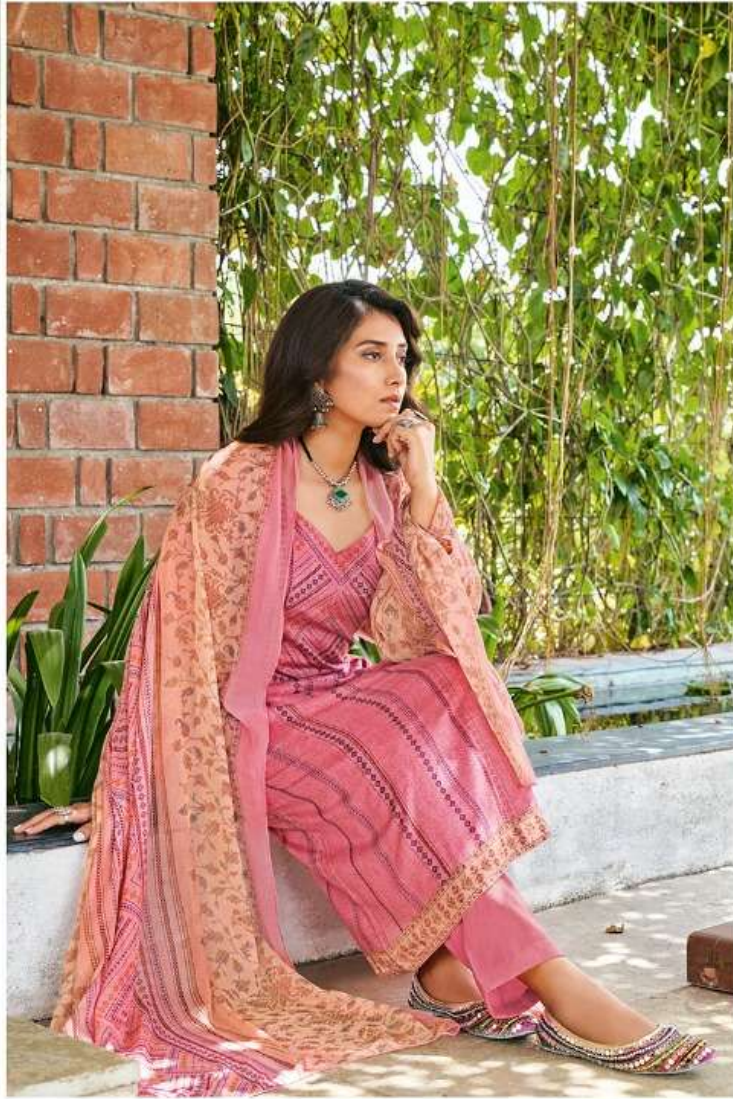
OUR MUSE FOR THIS SEASON IS STRONG, ELEGANT AND NEVER COMPROMISE COMFORT