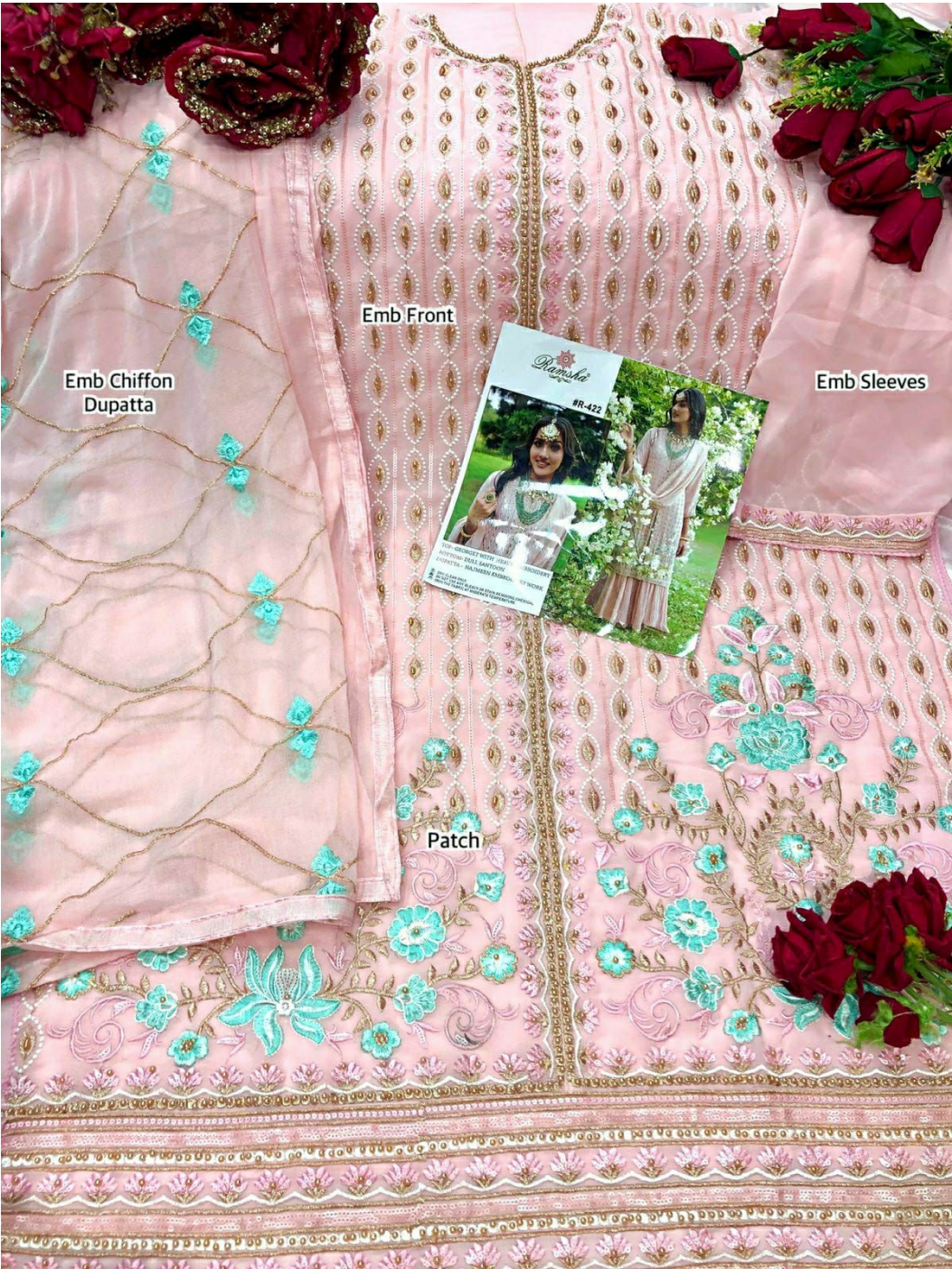
Emb Chiffon Dupatta