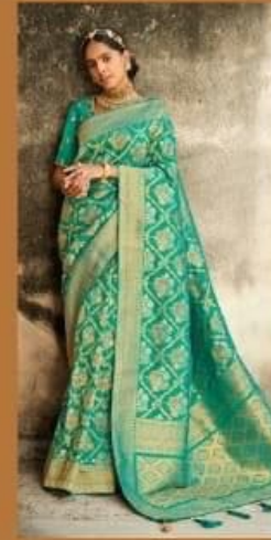
D. NO.- 2208