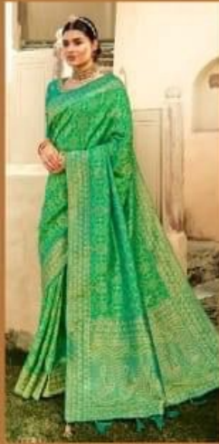
D. NO.- 2202