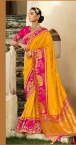
D. NO.- 2209