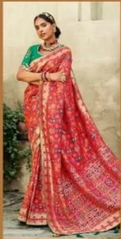
D. NO.- 2204