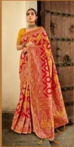
D. NO.- 2201