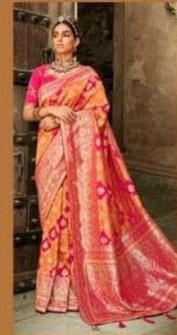
D. NO.- 2212