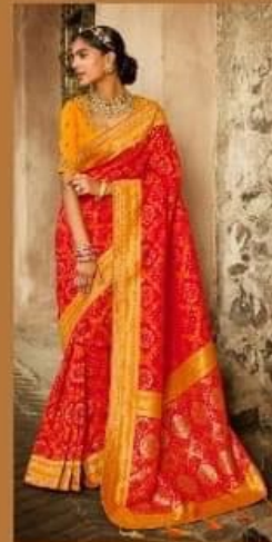
D. NO.- 2210