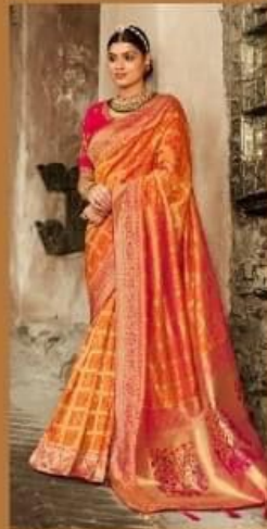
D. NO.- 2206