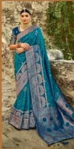
D. NO.- 2205