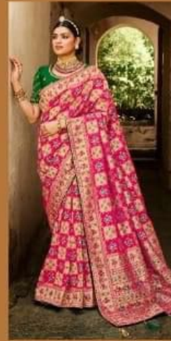
D. NO.- 2207