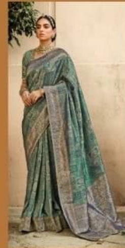
D. NO.- 2211