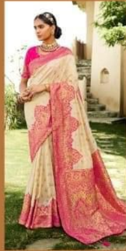
D. NO.- 2203