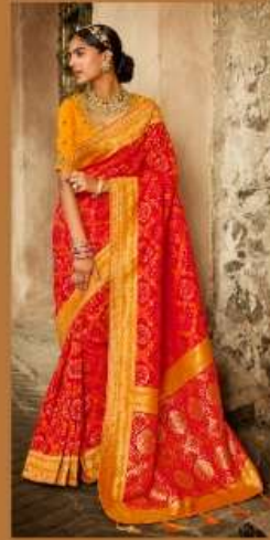
D. NO.- 2210