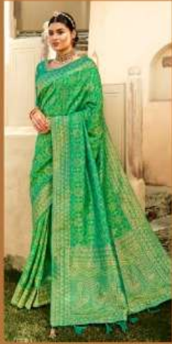
D. NO.- 2202