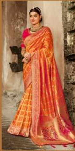
D. NO.- 2206