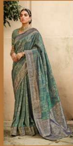
D. NO.- 2211