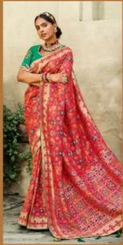
D. NO.- 2204