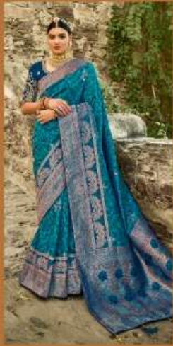
D. NO.- 2205