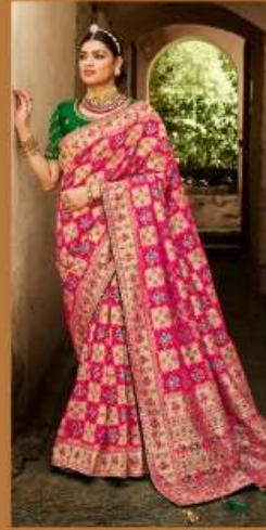
D. NO.- 2207