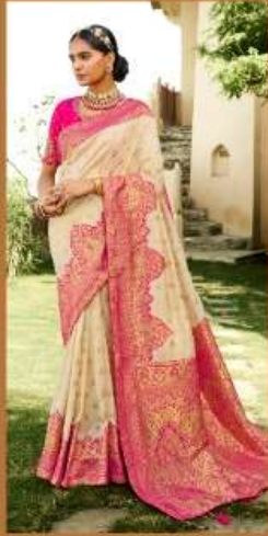
D. NO.- 2203