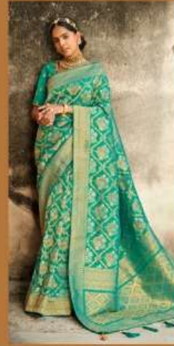
D. NO.- 2208