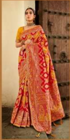
D. NO.- 2201