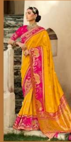
D. NO.- 2209