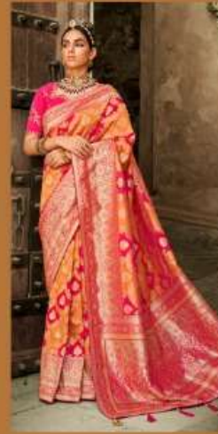
D. NO.- 2212