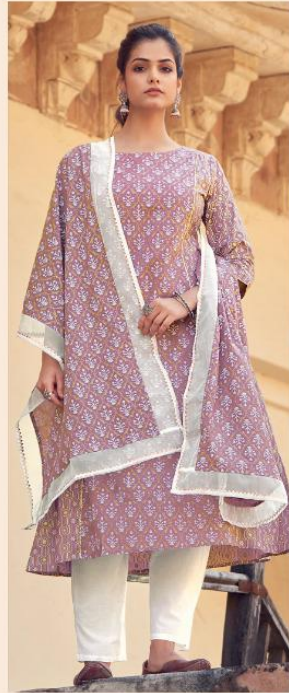
| 1004 |