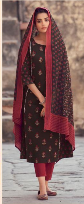
| 1005 |