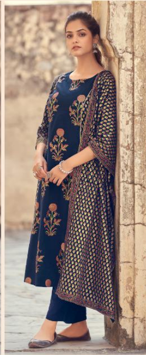
| 1006 |