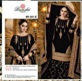
Emb Net Bottom