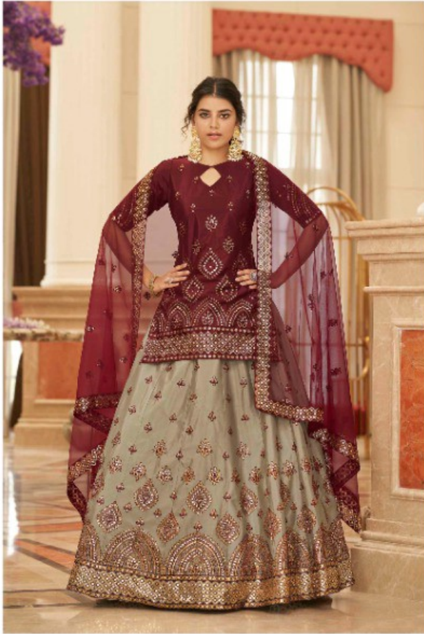
Rare, Eloquent and Alluring; a rich heritage of Indian craftsmanship and tradition unfurls in the new form of lehenga.