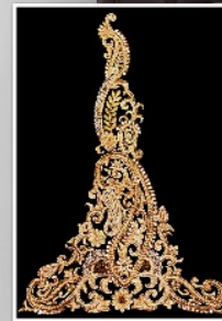
Zari, nakshi and dabka embellishment

Blue ombre shaded chiffon dupatta with sequin lace work on borders