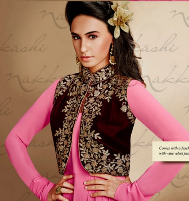
Comes with a fuschia art silk moss kalidar long anarkali along with wine velvet jacket. Dupatta in shaded net with all over butis.