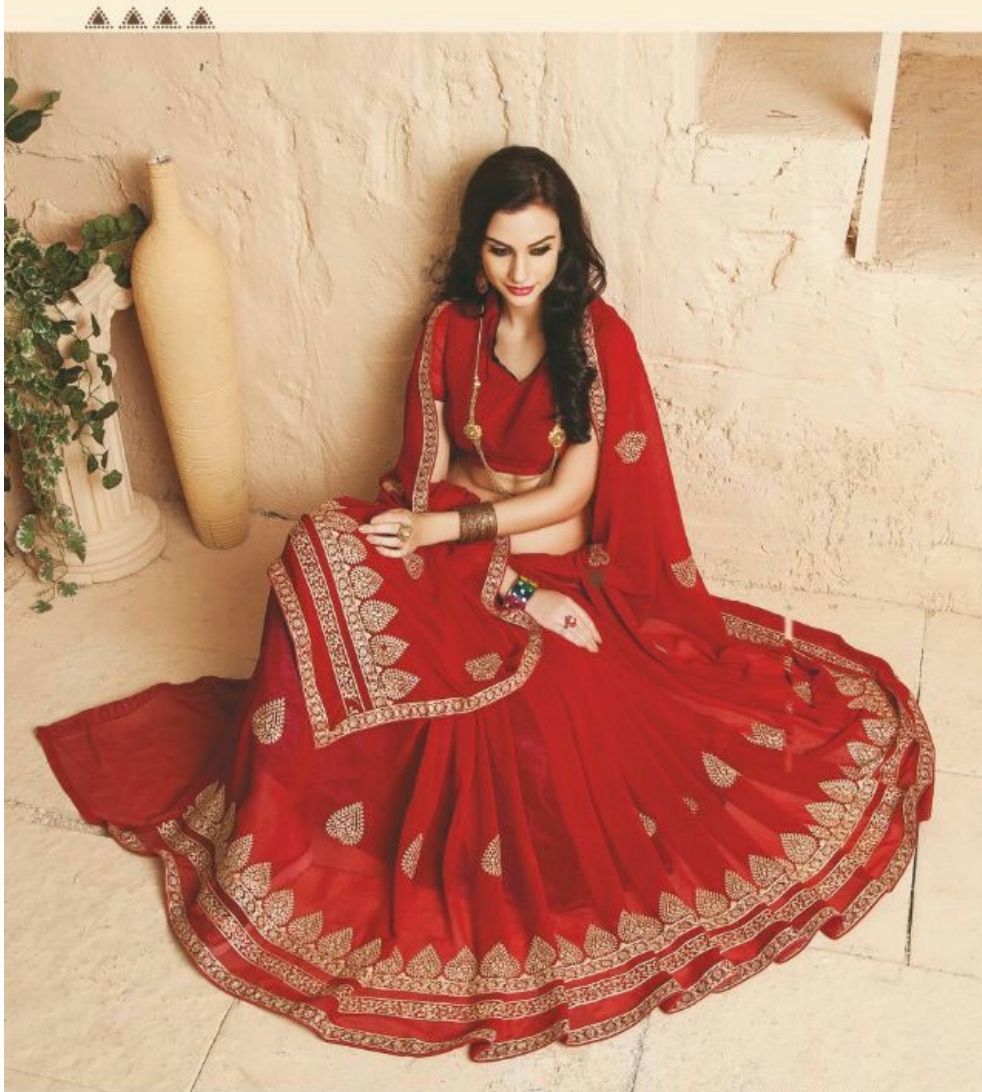
design brings flashy patterns on flimsy fabric which turns even the simplest style.