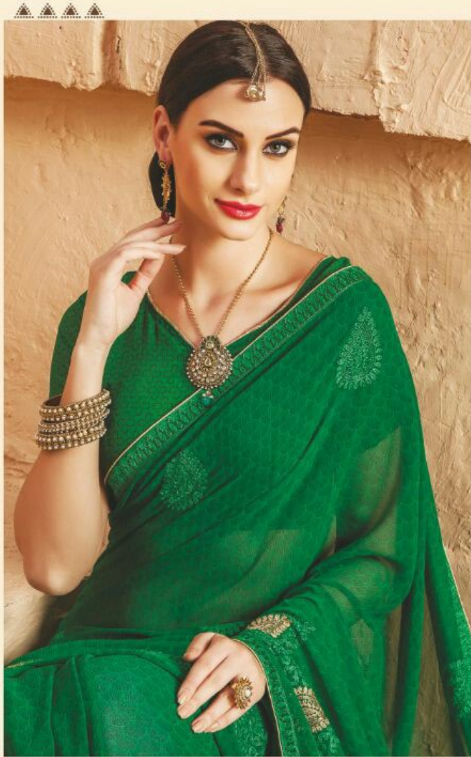
satisfy your desire of looking fabulous with our designs