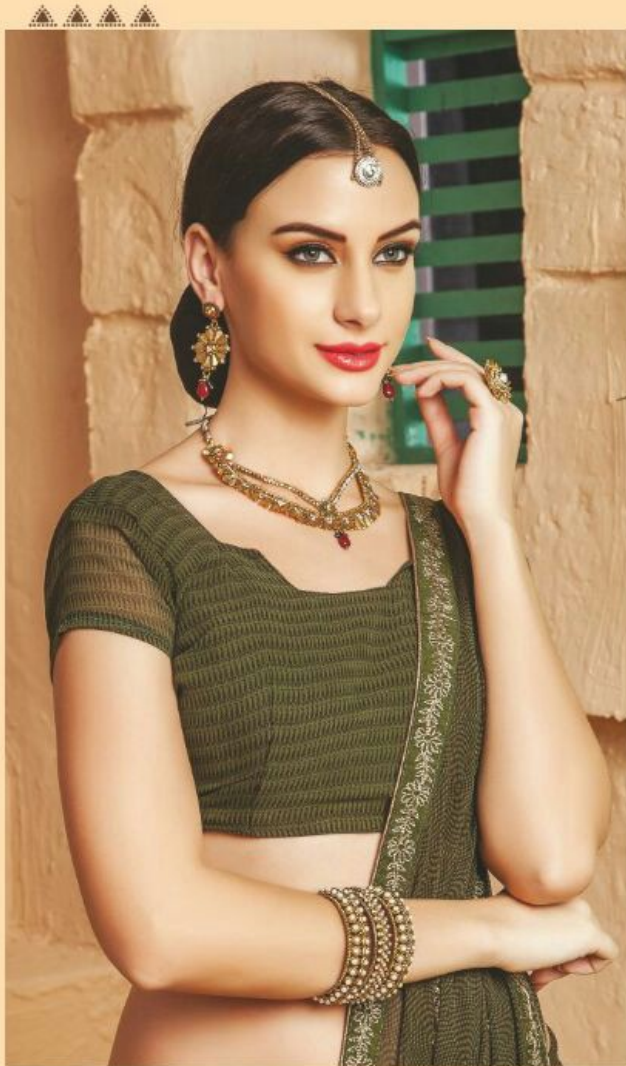
saree is reflection of culture & regional flavour