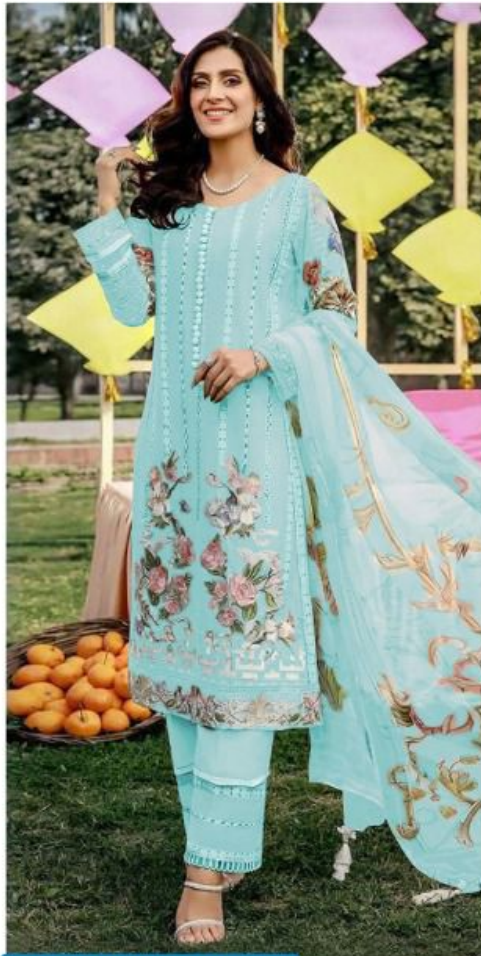
TEXTILE DEAL B