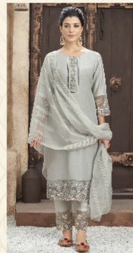
SHAK - 64