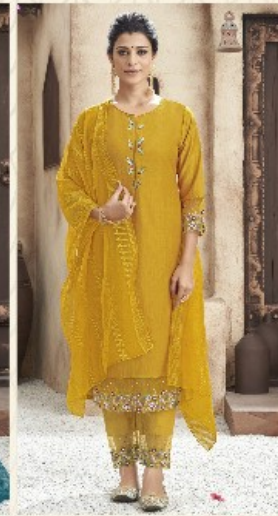
SHAK - 63