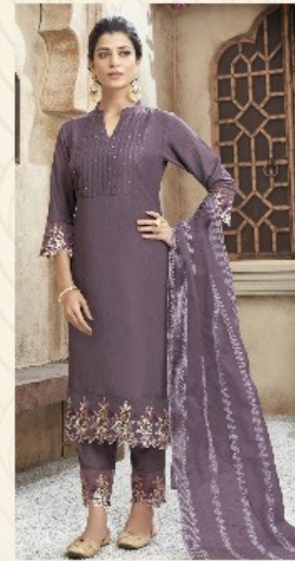
SHAK - 61