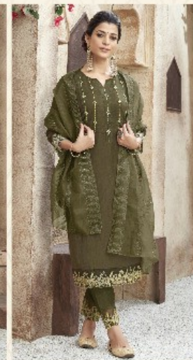
SHAK - 66