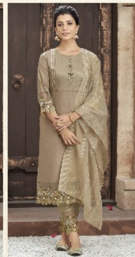
SHAK - 65