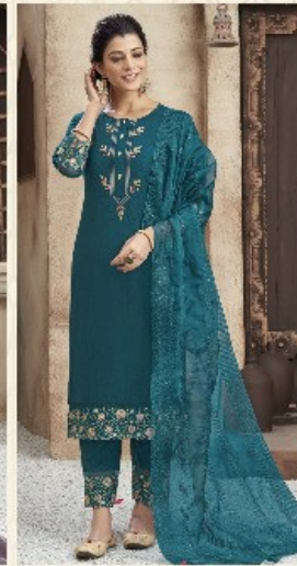
SHAK - 62