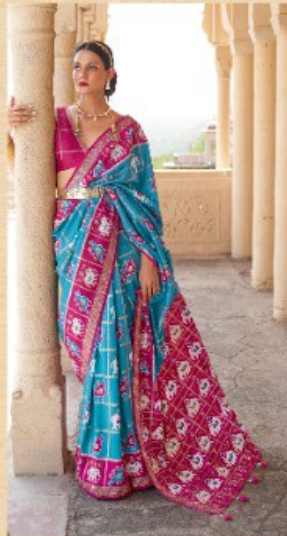
R 350 - B