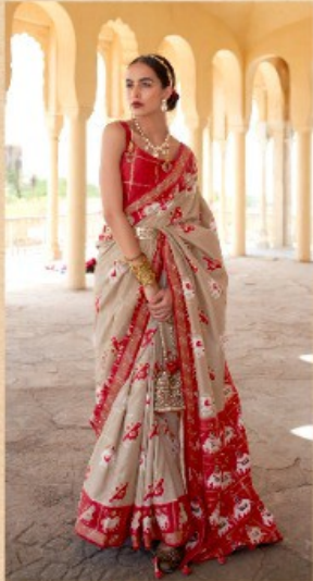
R 350 - C