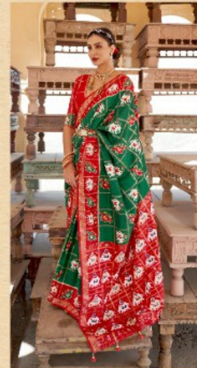
R 350 - G