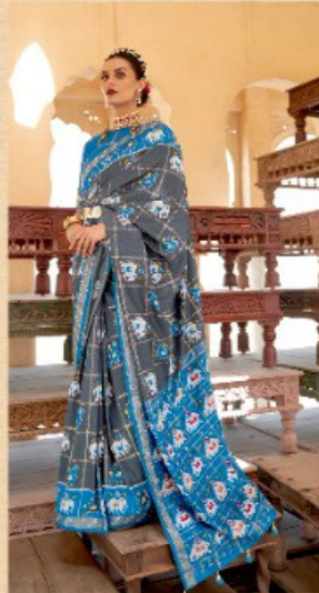
R 350 - E