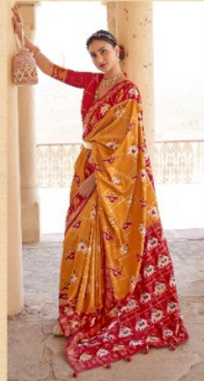
R 350 - I