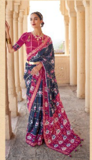
R 350 - K