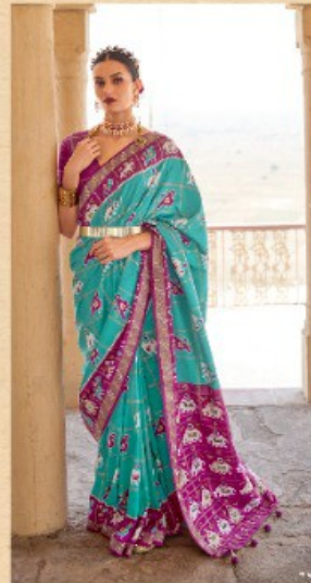
R 350 - F