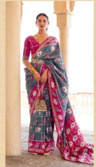
R 350 - H