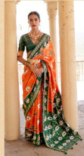
R 350 - J