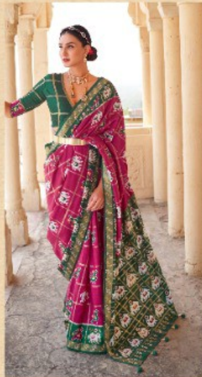
R 350 - A