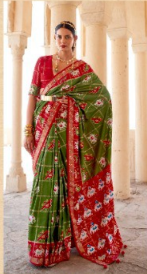
R 350 - D