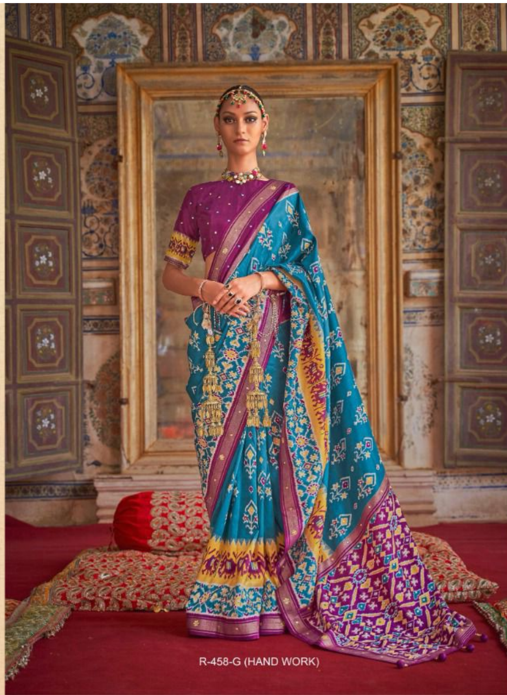
R-458-G (HAND WORK)