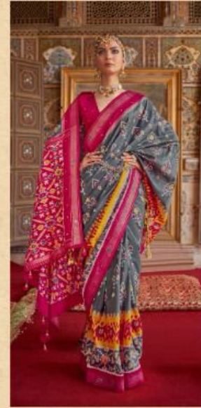
R-458-F (HAND WORK)