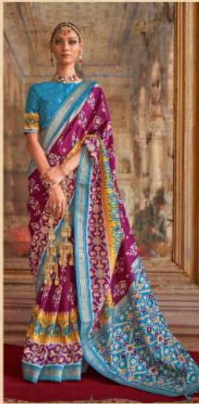
R-458-D (HAND WORK)