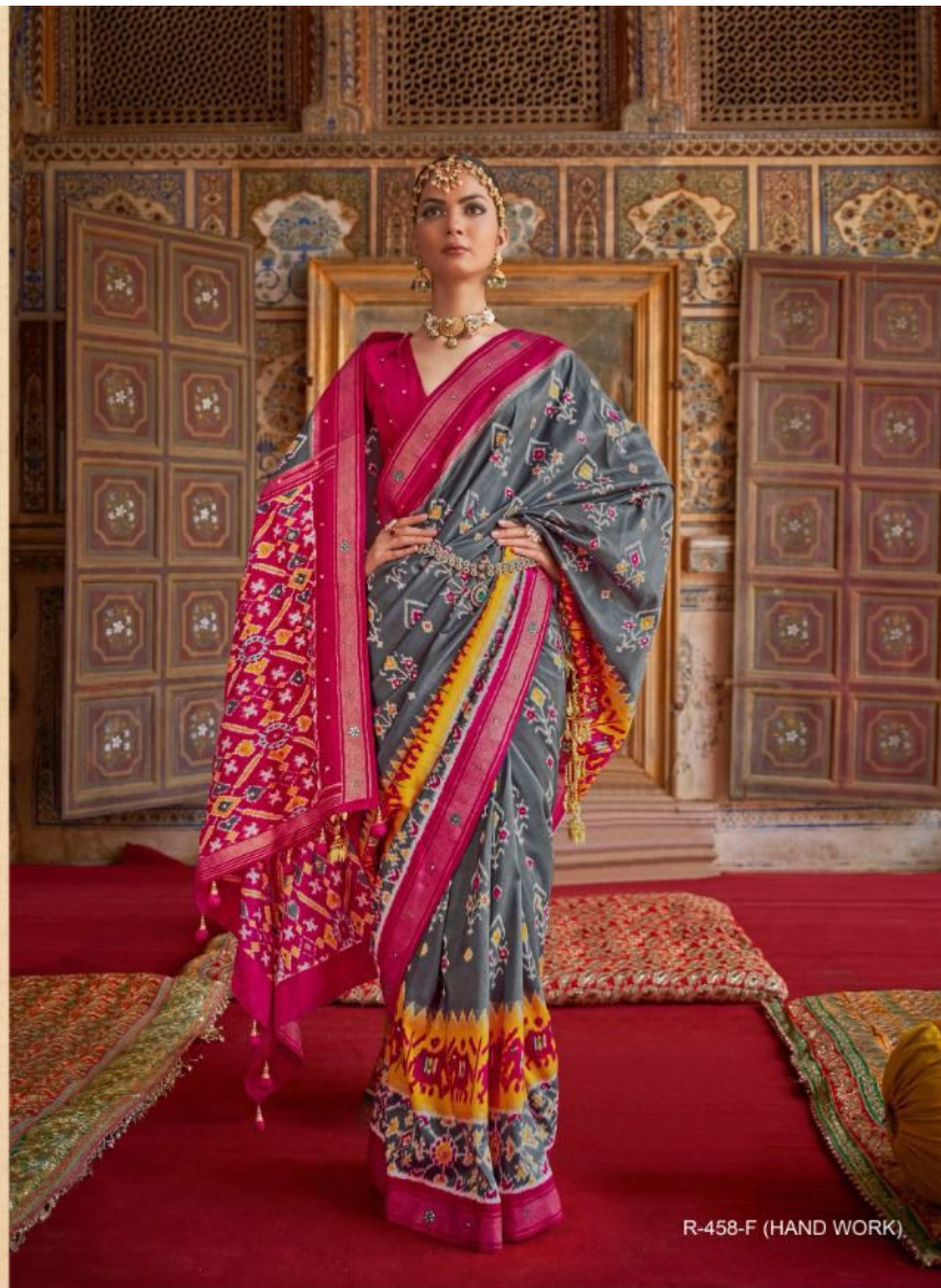
R-458-F (HAND WORK)