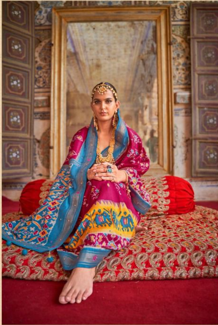
Indian Heritage Patola With Handwork

HOW DO YOU PERCEIVE FASHION IN PEOPLE'S DAILY LIVES? WHAT ARE THE TOP PATOLA TRENDS THIS SEASON?