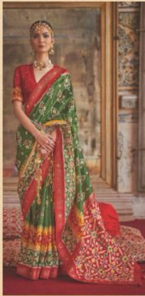
R-458-E (HAND WORK)