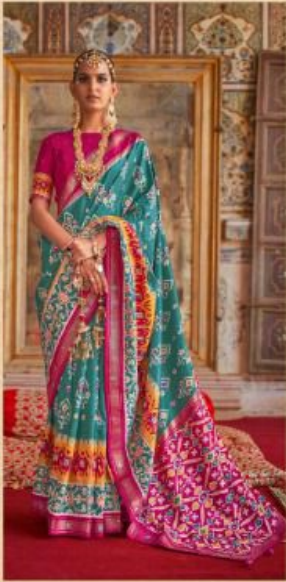
R-458 (HAND WORK)