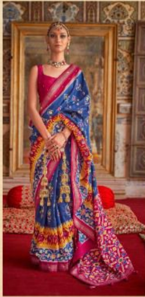
R-458-B (HAND WORK)