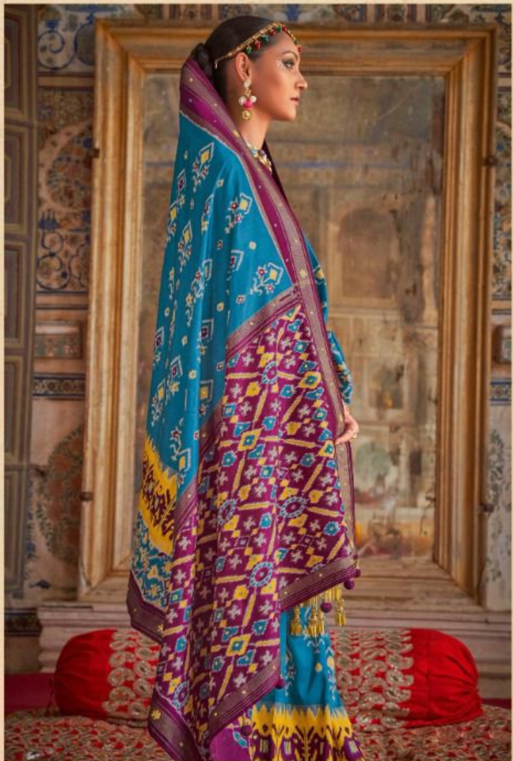
Indian Heritage Patola With Handwork

HOW DO YOU PERCEIVE FASHION IN PEOPLE'S DAILY LIVES? WHAT ARE THE TOP PATOLA TRENDS THIS SEASON?