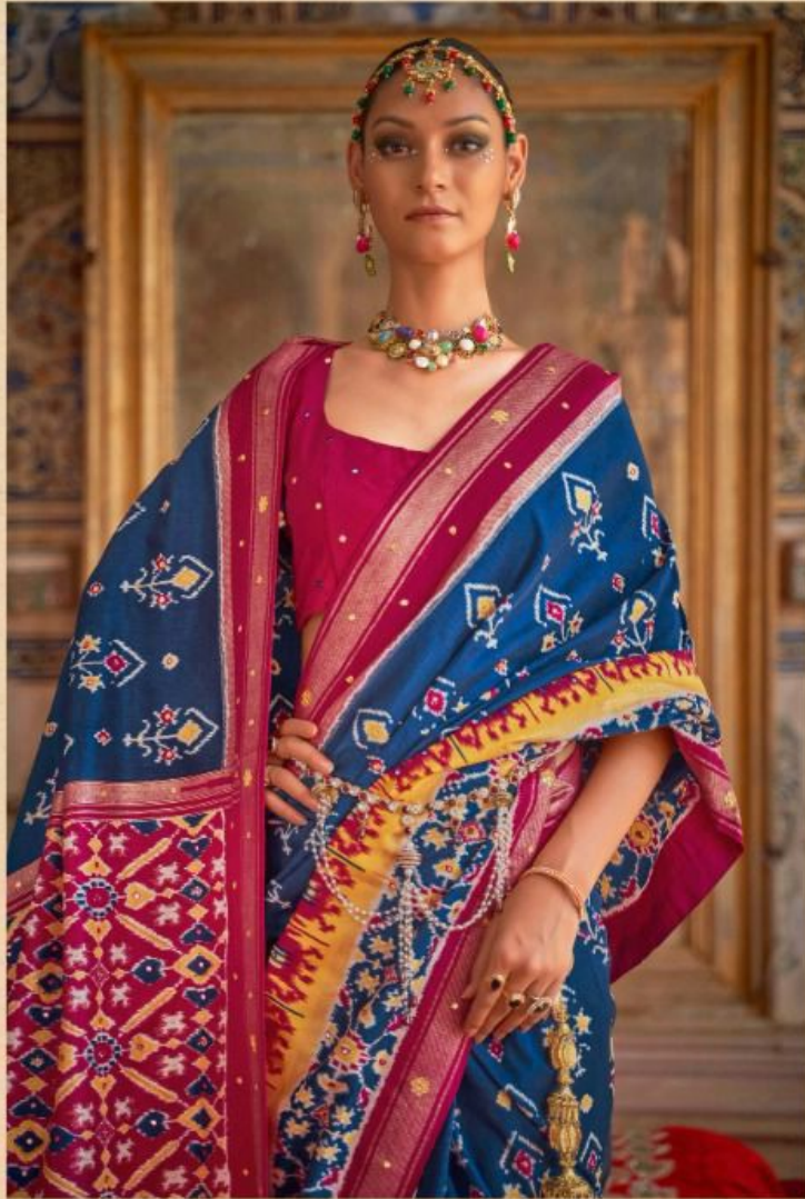
Indian Heritage Patola With Handwork

HOW DO YOU PERCEIVE FASHION IN PEOPLE'S DAILY LIVES? WHAT ARE THE TOP PATOLA TRENDS THIS SEASON?