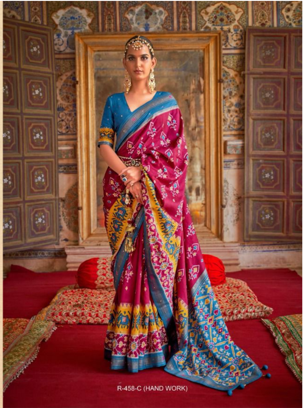
R-458-C (HAND WORK)