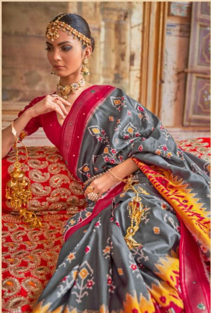
Indian Heritage Patola With Handwork

HOW DO YOU PERCEIVE FASHION IN PEOPLE'S DAILY LIVES? WHAT ARE THE TOP PATOLA TRENDS THIS SEASON?