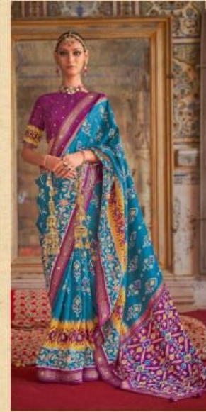
R-458-G (HAND WORK)