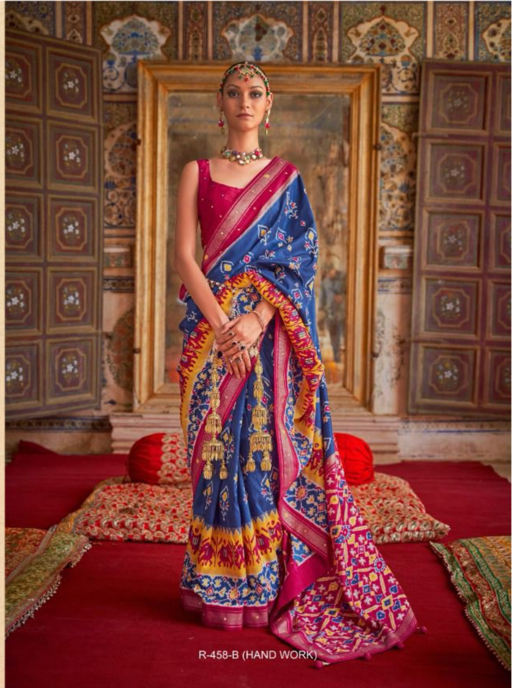
R-458-B (HAND WORK)