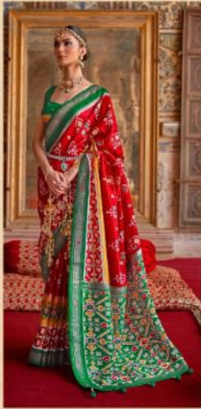
R-458-A (HAND WORK)