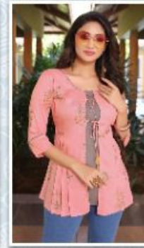
D No : 1007