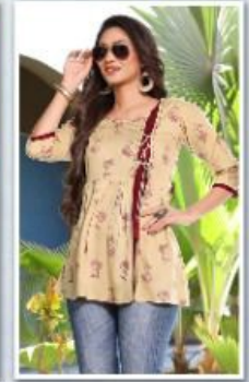
D No : 1008