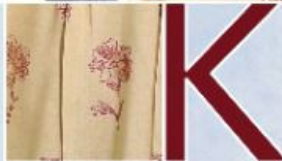
D No : 1008

A beautiful dress may look beautiful on a hanger, but that means nothing. It must be seen on the shoulders, with the movement of the arms, the legs, and the waist.