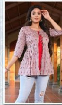
D No : 1006