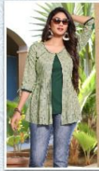
D No : 1005