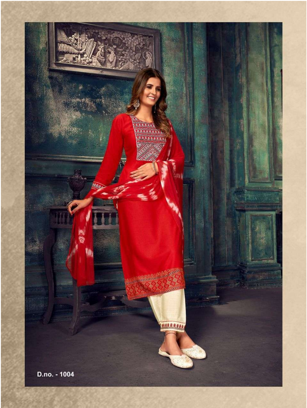
D.no. - 1004