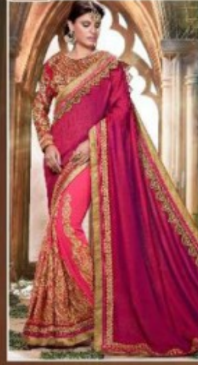
D.No : 52