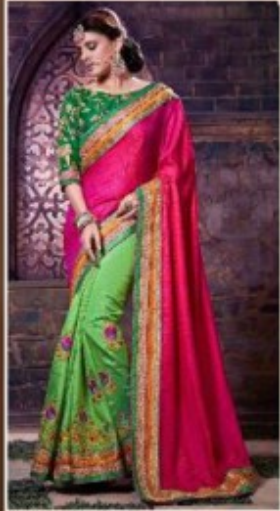
D.No : 54