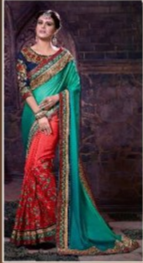
D.No : 50