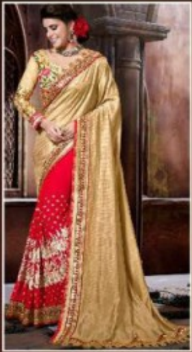
D.No : 49