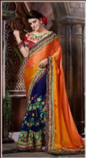
D.No : 53