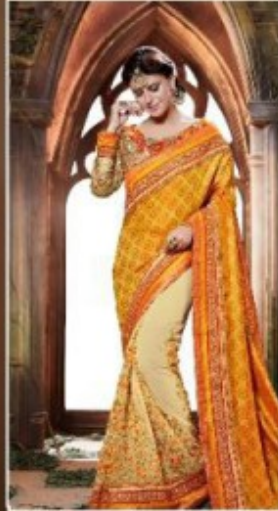
D.No : 55