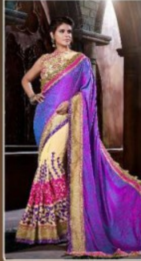
D.No : 51