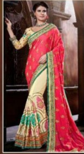
D.No : 56