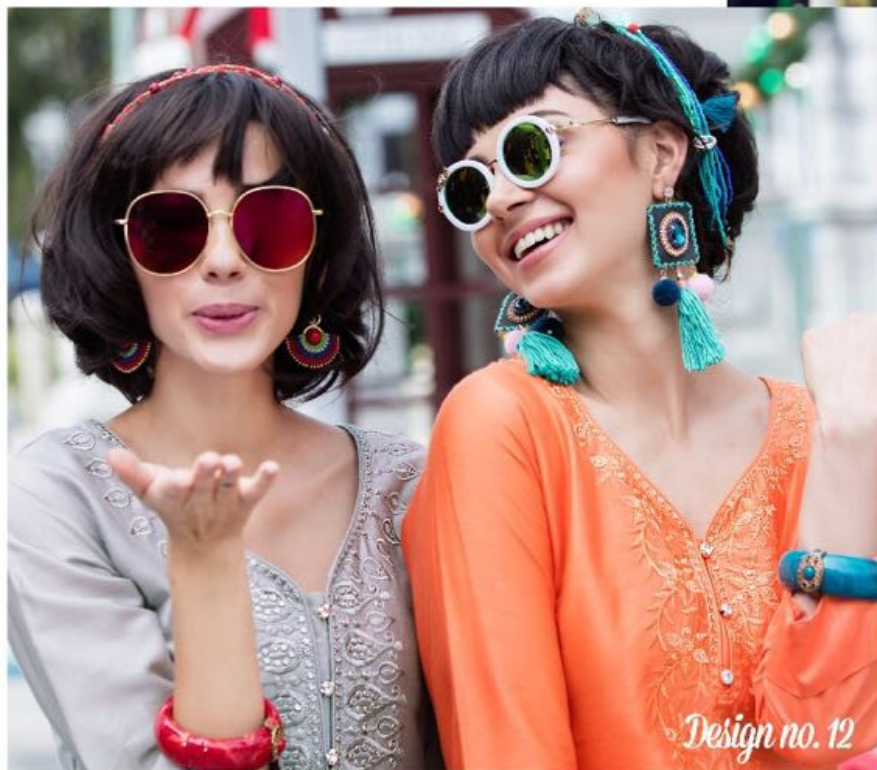
Design no. 12

It's a new era in fashion - there are no rules. It's all about the individual and personal style, wearing high-end, low-end, classic labels, and up-and-coming designers all together.