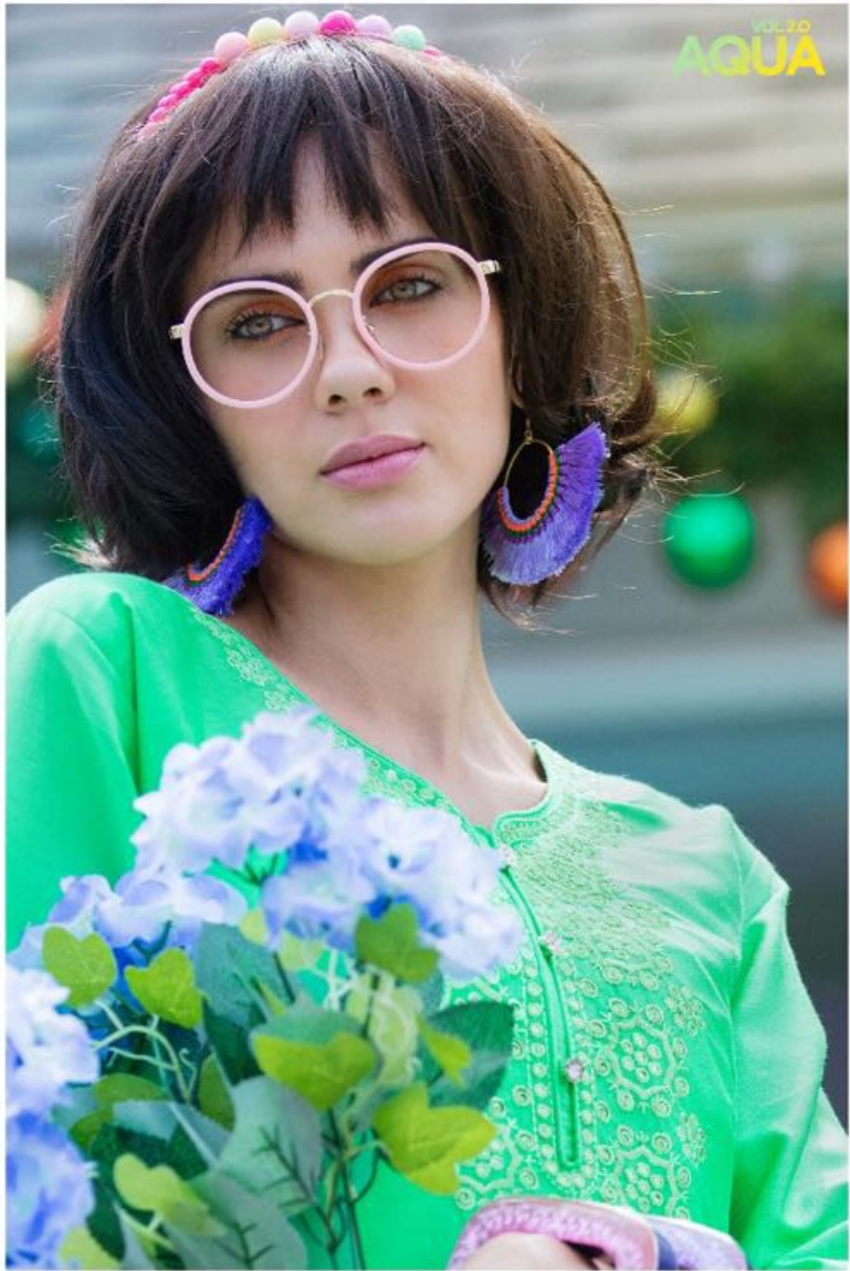
It's a new era in fashion - there are no rules. It's all about the individual and personal style, wearing high-end, low-end, classic labels, and up-and-coming designers all together.