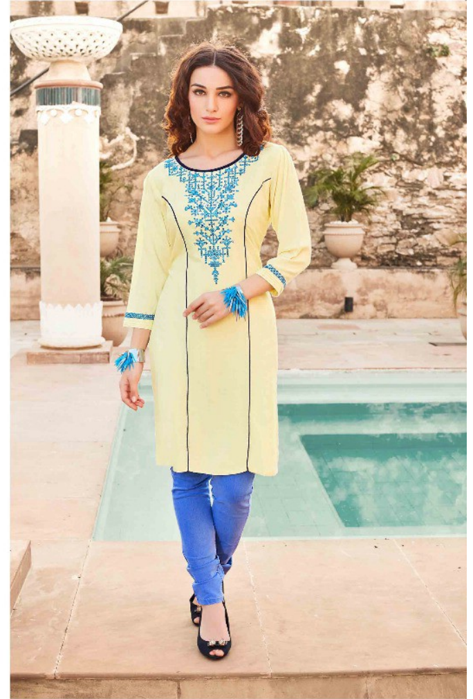
Design No. 8011

Casual dress is selected with care so that they make any lady wearing it, look enchanting & adorable. You have to do is follow the flower print, which will be your new effect.