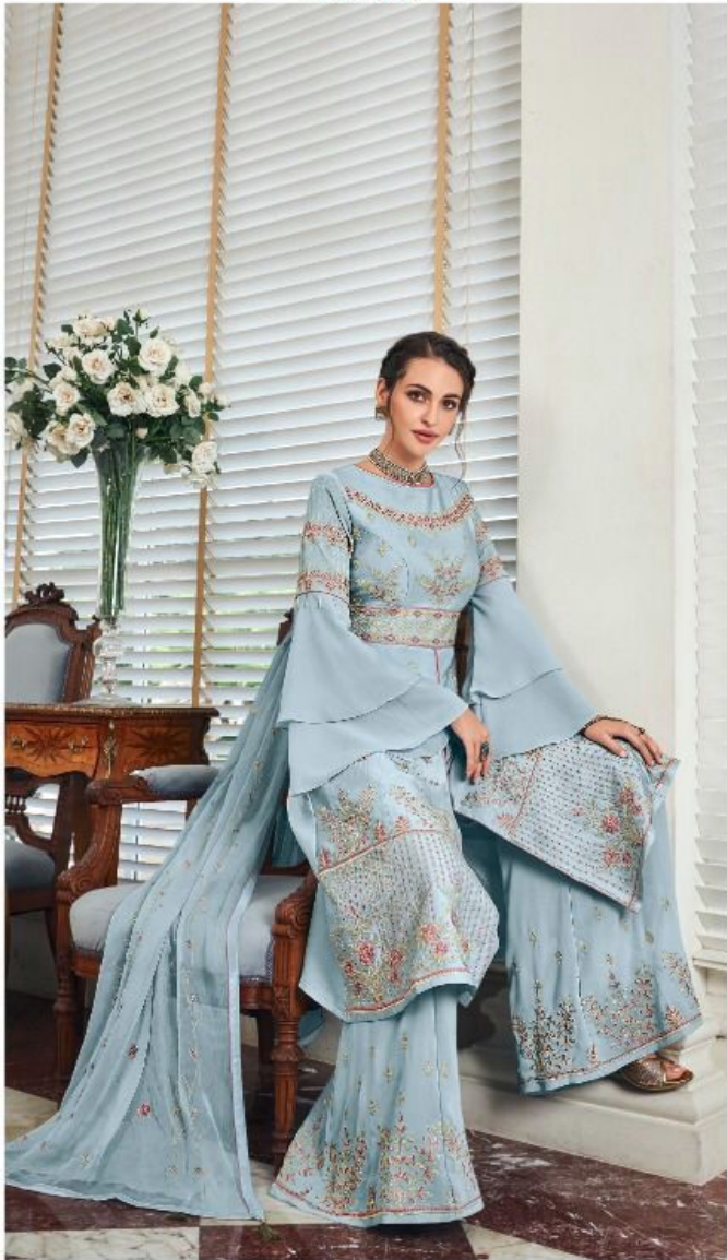
SIMPLE WITHOUT LETTING GO OF ELEGANCE - TRADITION WITH NATURAL FABRICS.