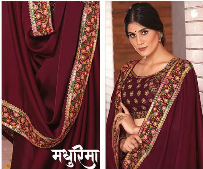
DRIPPING WITH SWEETNESS OF HONEY, THIS SAREE IS APPEALING AND CLASSICAL...