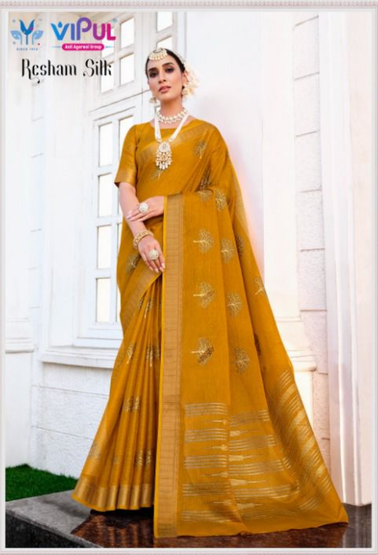
61208 (EXCLUSIVE FOIL)