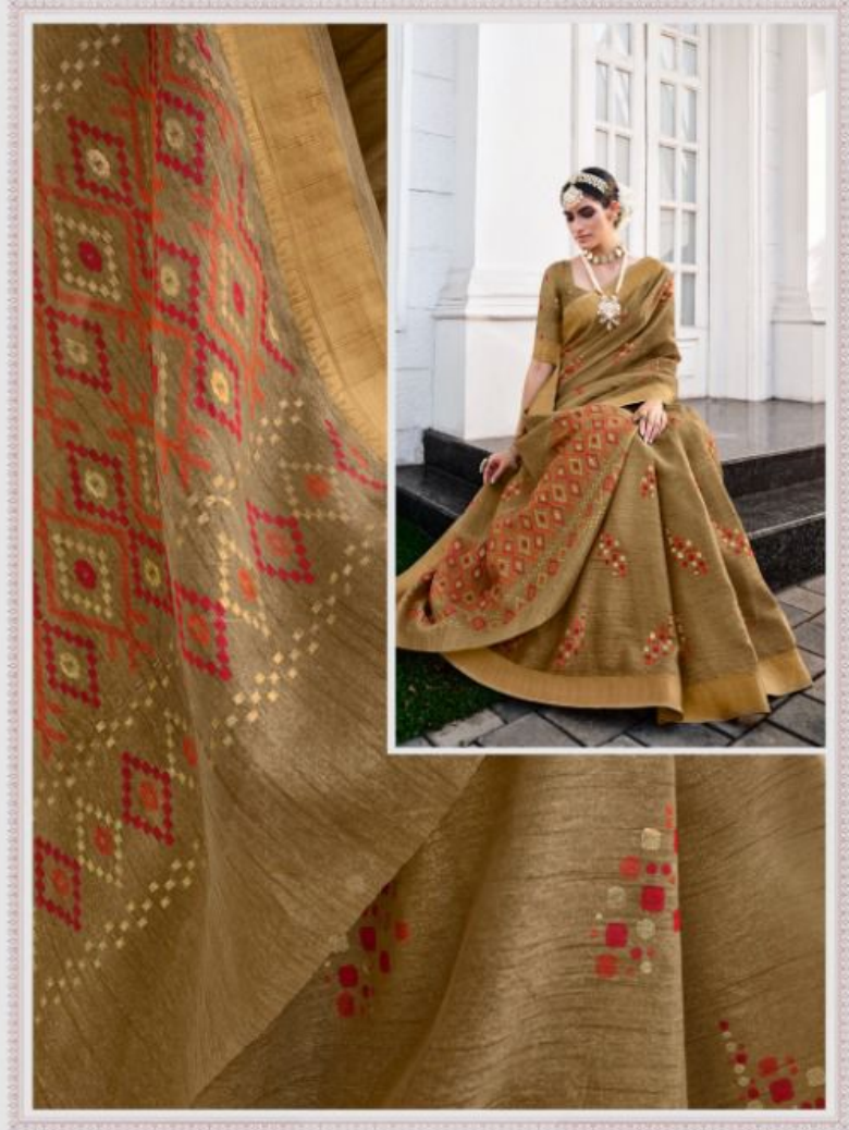
61207 (EXCLUSIVE FOIL)