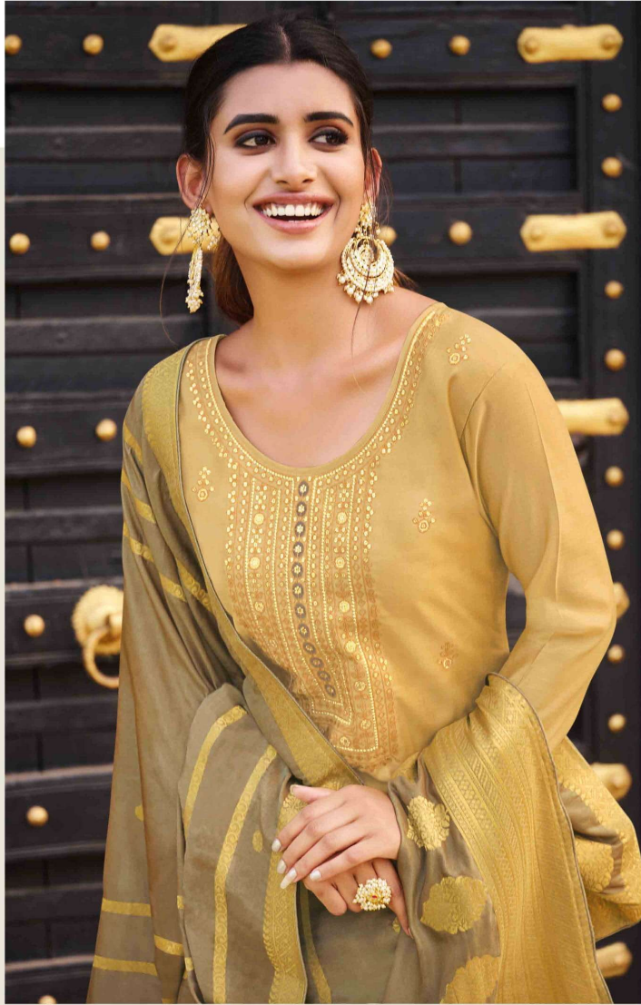
SIMPLE ELEGANCE AND TRADITIONAL WITH LUXURIOUS FABRICE