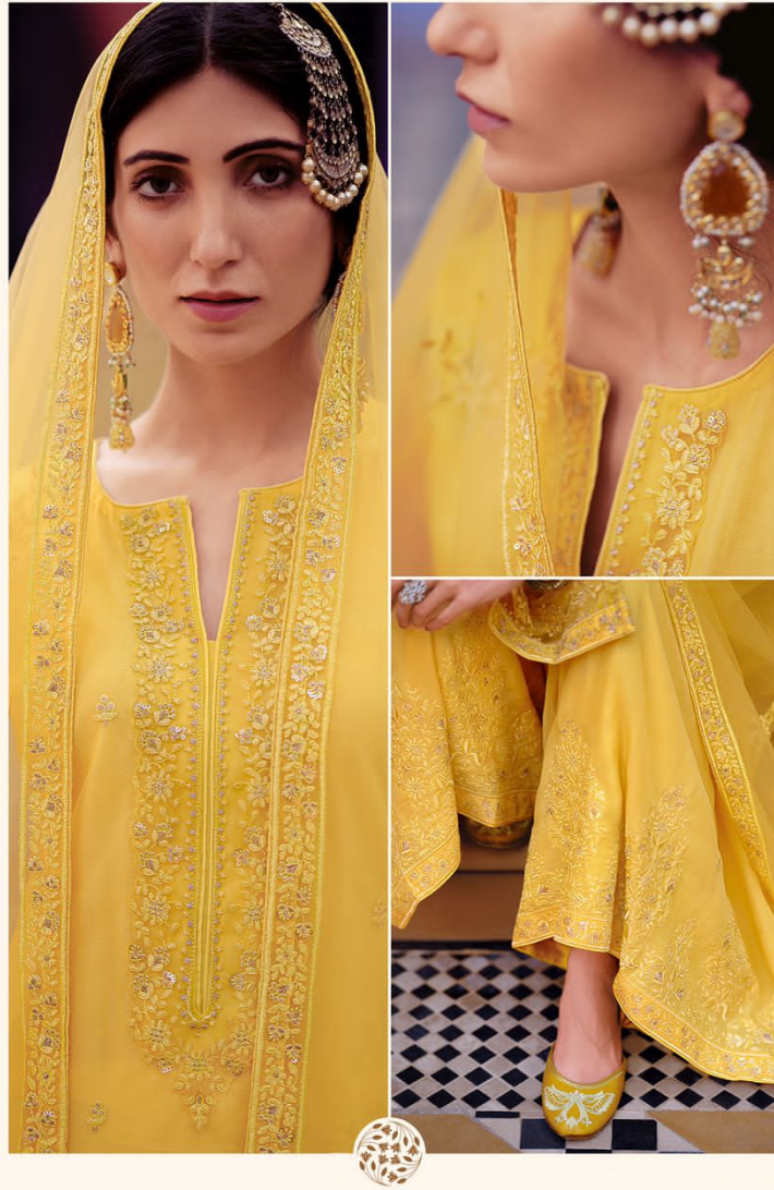
Look stunning in this light yellow luxurious ensemble with exquisite thread embroidery along with sequins. This design is finished with embroidered bottom and an elegant net dupatta.