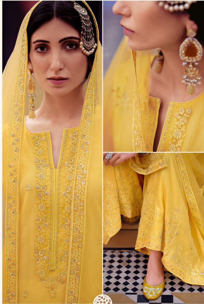
Look stunning in this light yellow luxurious ensemble with exquisite thread embroidery along with sequins. This design is finished with embroidered bottom and an elegant net dupatta.