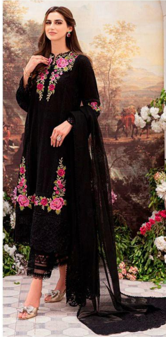
D 5406 A