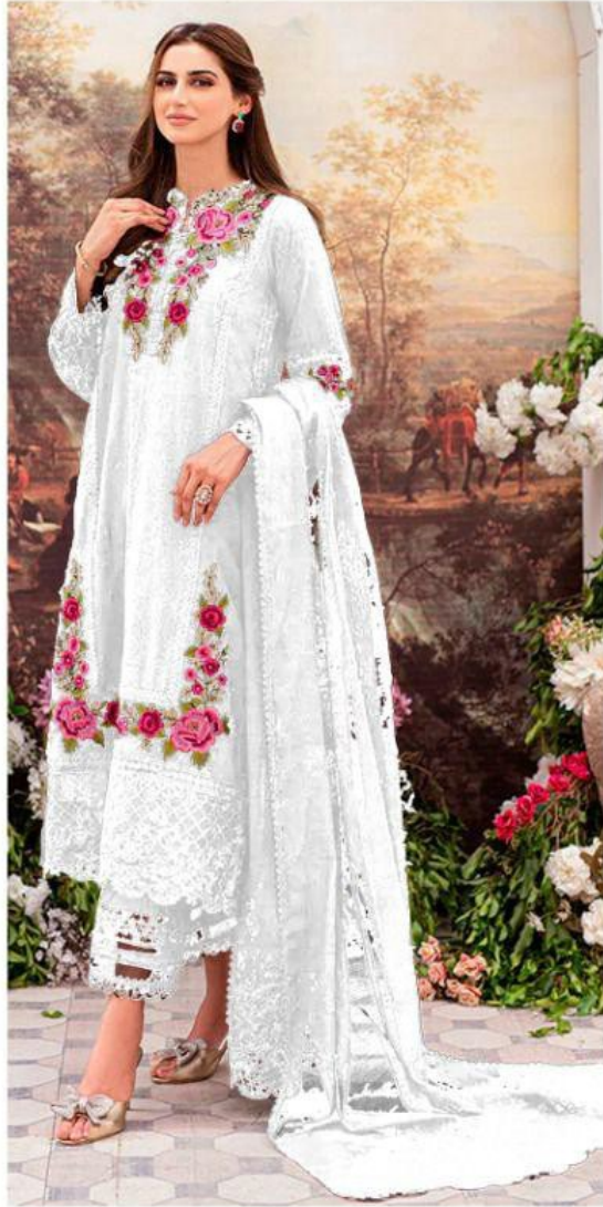
D 5406 B