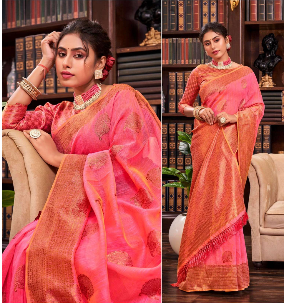
This enchanting ensemble is a vision of pure beauty and handcrafted finesse. With powder peach, green and pink floral embroidery over a flattering palette of peach and gold, this attire is one of the most beautiful pieces in the collection.