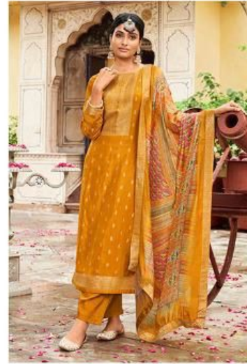
MANDAKINI | 6003