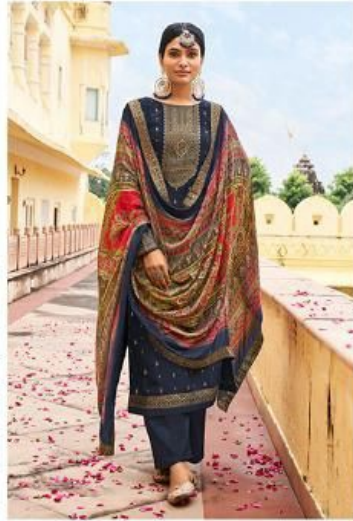
MANDAKINI | 6002