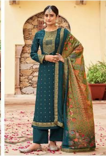
MANDAKINI | 6004