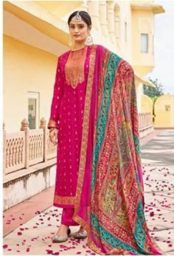
MANDAKINI | 6001