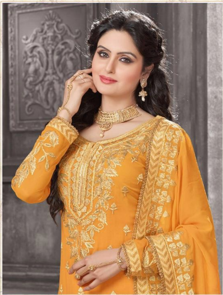
Knock down the statement factor with a classy look.