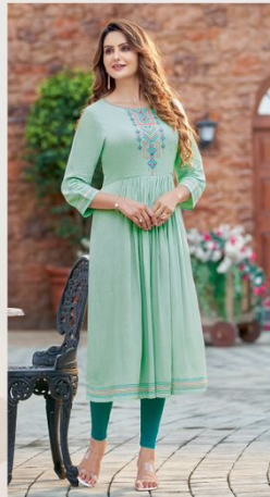
d.no : 1010