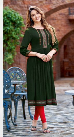
d.no : 1008