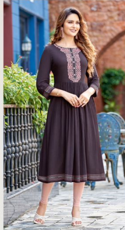
d.no : 1007