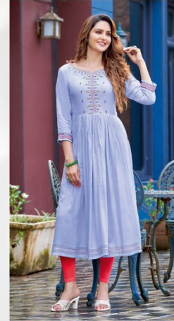
d.no : 1009