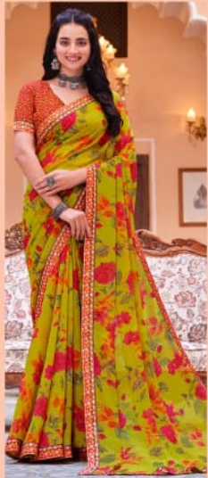
64505 (WITH STONE WORK)