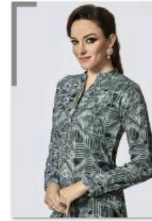
Style : 122