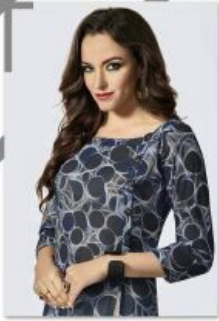
Style : 119