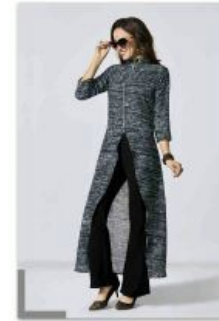
Style : 123