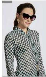
Style : 120