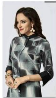
Style : 121