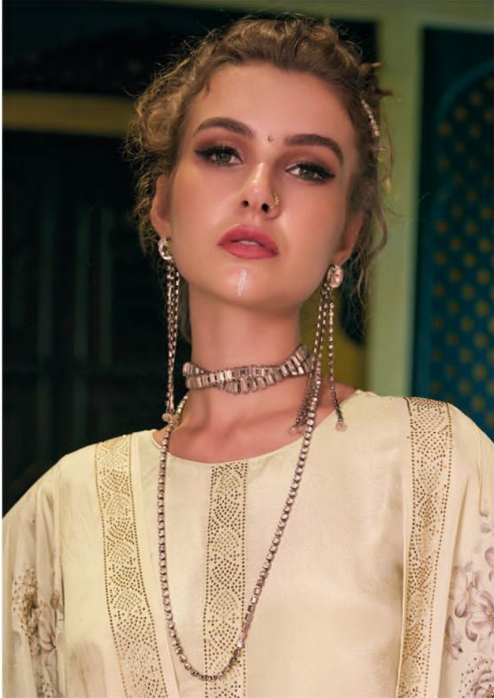
THESE ARE THE BRANDS TAKING OVER YOUR SOCIAL MEDIA FEED