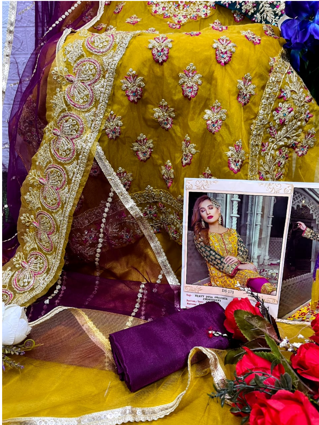
DS-173 Top: HEAVY DULL ORGANZA Bottom: INCR. EMBROIDERY