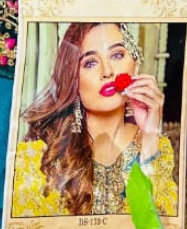
DO-113-C THE HEAVY DOLL BRIDGES DESIGNED BY DESIGNER: S. S. S. S. DESIGNER: S. S. S. S.