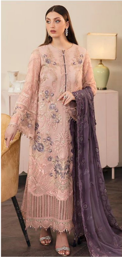
TEXTILE DEAL A