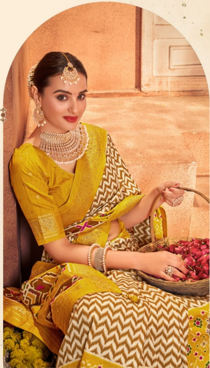
It's a brilliantly affordable new looks in every places Look graceful, Stylish, elegant & sensuous