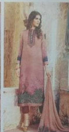
— NAAZ — 105