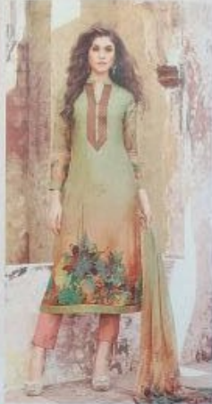
— NAAZ — 103