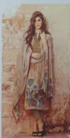
— NAAZ — 109