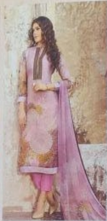
— NAAZ — 102