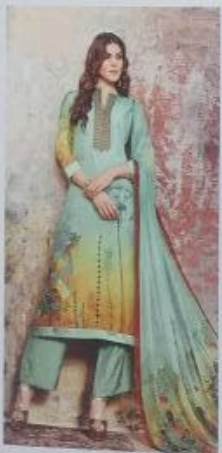
— NAAZ — 107