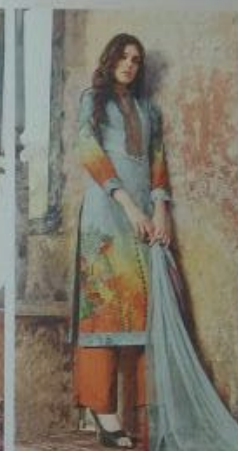
— NAAZ — 106