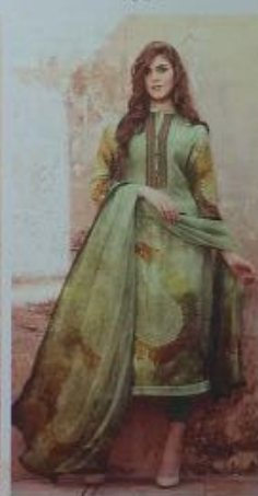
— NAAZ — 110