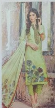
— NAAZ — 104