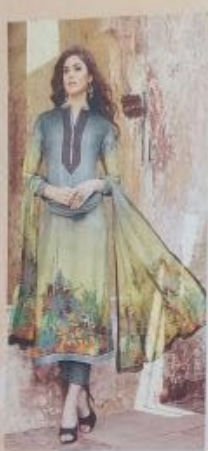
— NAAZ — 101