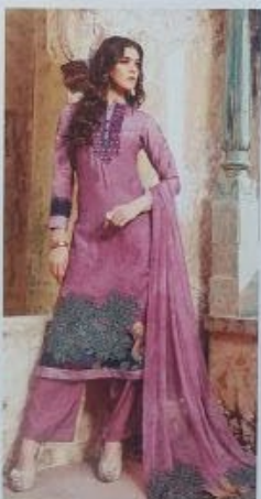
— NAAZ — 108