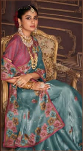
64110 (With Stone work)