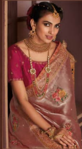
64109 (With Stone work)