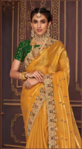
64107 (With Stone work)