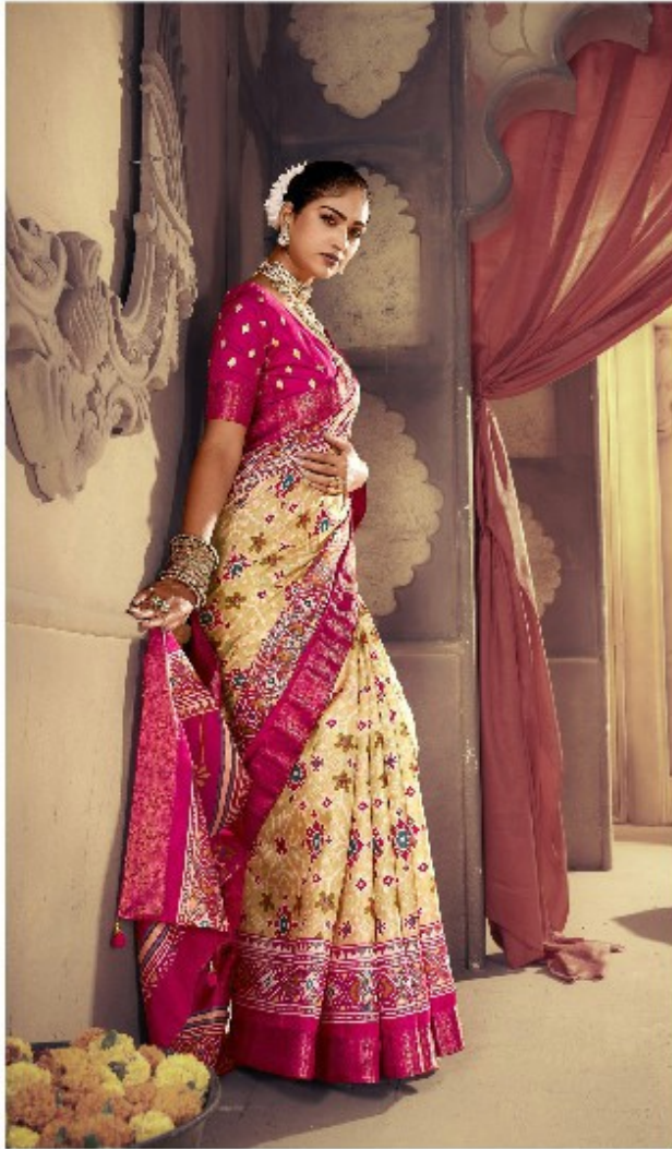
Experience the art of the saree. The saree is a beautiful and elegant attire. It is a traditional Indian garment. The saree is a long piece of fabric, which is draped over the shoulder and around the waist. It is a versatile and comfortable garment. The saree is a beautiful and elegant attire. It is a traditional Indian garment. The saree is a long piece of fabric, which is draped over the shoulder and around the waist. It is a versatile and comfortable garment.