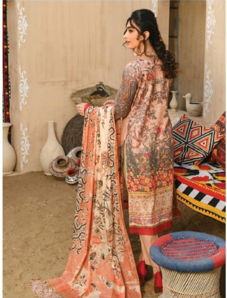
Design #. 007