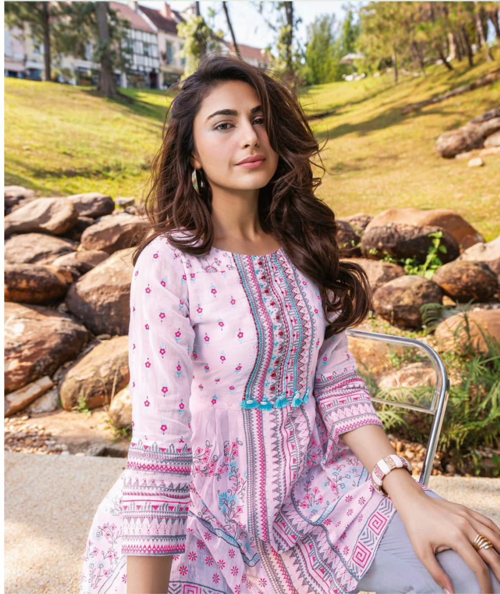
extreme beauty shots of stirling colours perfect season statement in a fabric mix of indian fashion