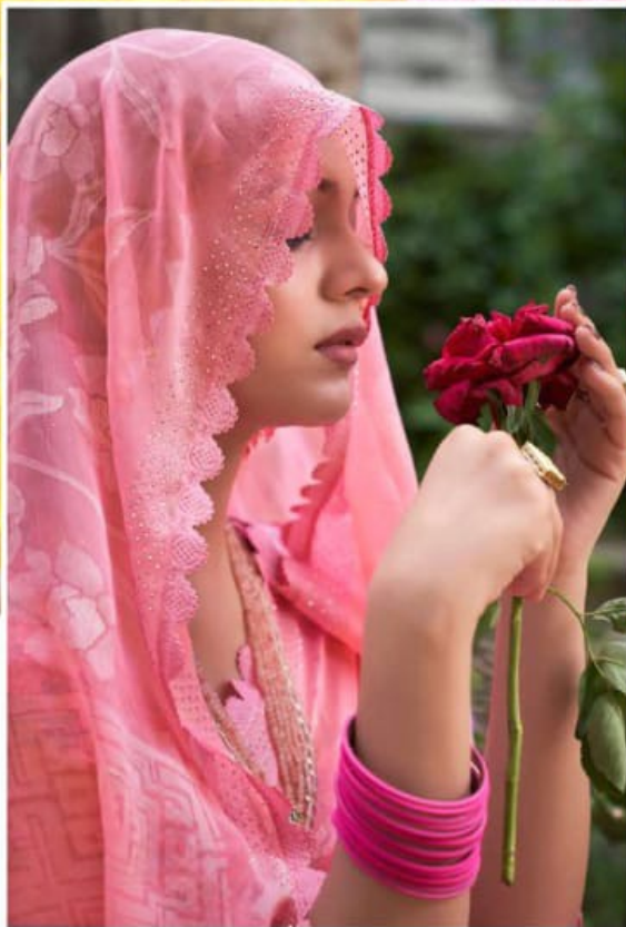
THE NEW MINIMALIST SHOW STEALING RED MEETS GOES OUT OF STYLE AS THE COLOUR OF LOVE AND MISCHIEF IT REMAINS THE QUOTESSENTIAL BEARD OF FEMINITY